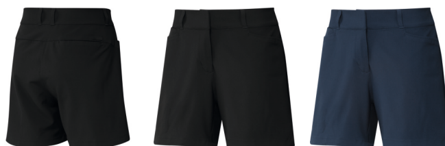
GK8496 06/01/22 GN7156 06/01/22