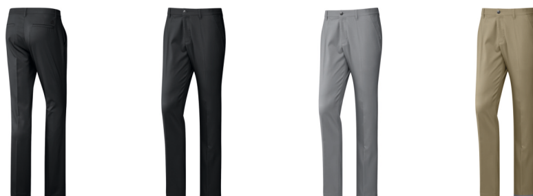
HA9139 06/01/22 HA9140 06/01/22 HC5581 06/01/22