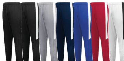
BLACK/BLACK 425 BLACK/WHITE 420 GRAPHITE/WHITE R04 NAVY/WHITE 301 ROYAL/WHITE 280 SCARLET/WHITE 408 WHITE/BLACK 226