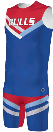
Diagonal Color Block