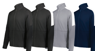
BLACK/BLACK 425 BLACK/WHITE 420 GRAPHITE/WHITE R04 NAVY/WHITE 301