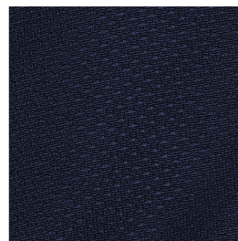
Back Insert Mesh