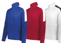
ROYAL/WHITE 280 SCARLET/WHITE 408 WHITE/BLACK 226