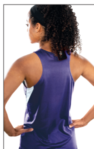
Modified Racerback on Ladies