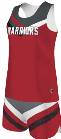
Diagonal Color Block