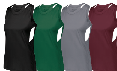
BLACK/ WHITE 420