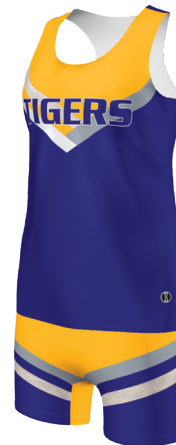
Diagonal Color Block