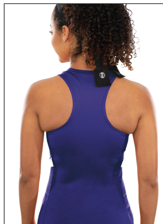
Racerback on Ladies