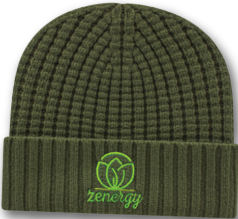
Stitch Count: 3,729

$1.30(A) each to add a standard pom. Adding a pom will increase production time.