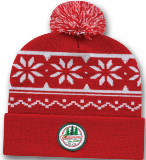
Shown with optional Woven Patch