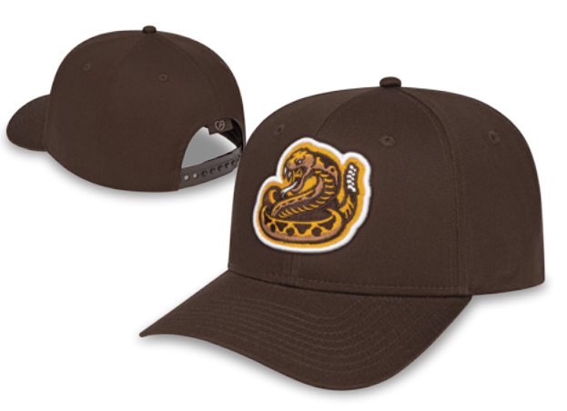
Stitch Count: 19,309 Shown with optional 3D Embroidery