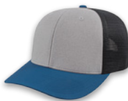
Silver/Indigo Blue/ Black