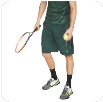
DYNO 9" SHORT $19.99 SALE!