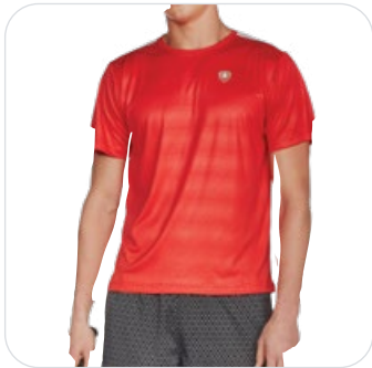
TRACTION CREW $19.99 SALE!