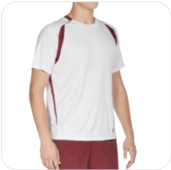
PRECISE CREW $19.99 SALE!