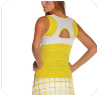
LOOK-OUT TANK $14.99 SALE!