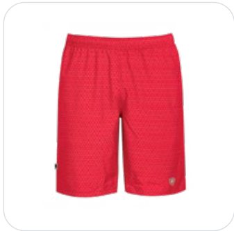
DIAMOND-DAZE SHORT $19.99 SALE!