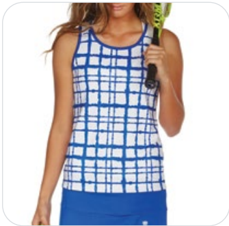
ABSOLUTE TANK $14.99 SALE!