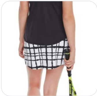
CHAOS SKORT $14.99 SALE!