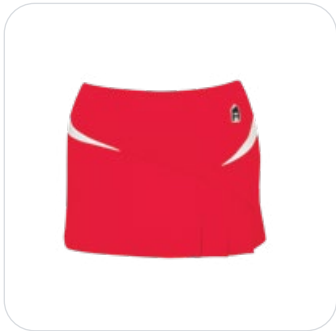
COMPETE SKORT $29.99 SALE!