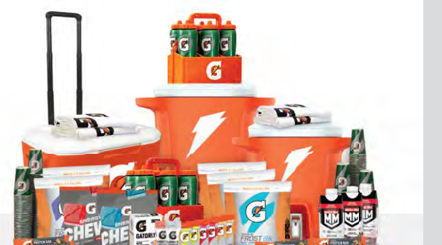
RETAIL -$1.625 $325