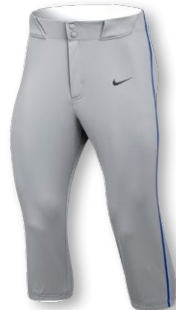
NEW NIKE STOCK VAPOR SELECT2 HIGH PIPED PANT DX9139 Page 21