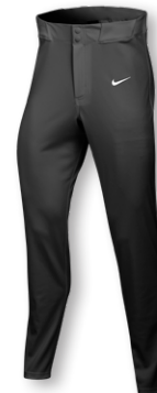
NEW NIKE STOCK VAPOR SELECT2 PANT DX9154 Page 20