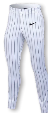
NEW NIKE CUSTOM VAPOR SELECT2 PANT DX9092 Page 16