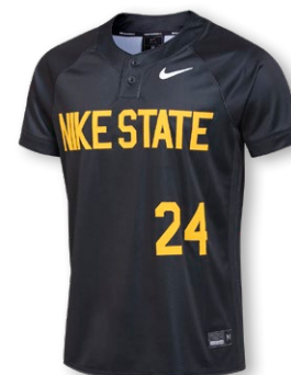
NEW NIKE DIGITAL VAPOR SELECT2 JERSEY DX9138 Page 9