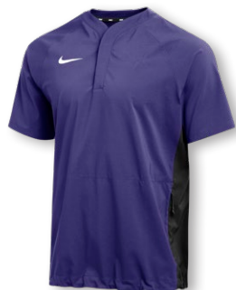
NIKE SS SLEEVE WINDSHIRT D09175 Page 24