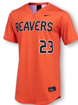
NIKE DIGITAL VAPOR PREMIER JERSEY DX9127 Page 7