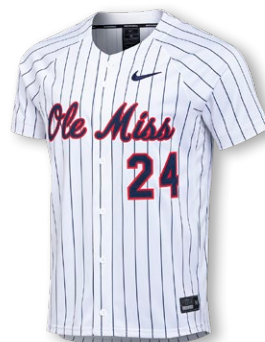
NEW NIKE DIGITAL VAPOR SELECT2 FB JERSEY DX9126 Page 8