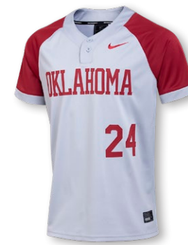
NEW NIKE CUSTOM VAPOR SELECT2 2B JERSEY DX9065 Page 14