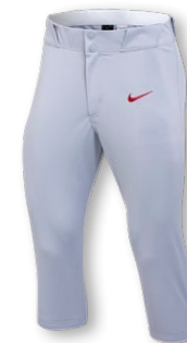
NEW NIKE CUSTOM VAPOR SELECT2 HIGH PANT DX9090 Page 16