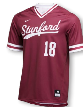
NIKE DIGITAL THROWBACK JERSEY AA9769 Page 10