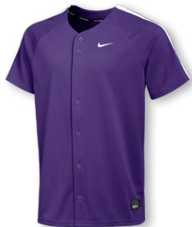
NEW NIKE STOCK VAPOR SELECT2 FB JERSEY DX9147 Page 17