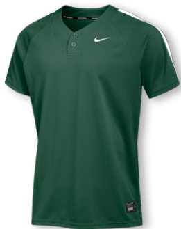
NEW NIKE STOCK VAPOR SELECT2 2 BUTTON JERSEY DX9156 Page 18