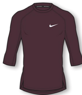
NIKE STOCK DF 3QT TOP D09173 Page 25