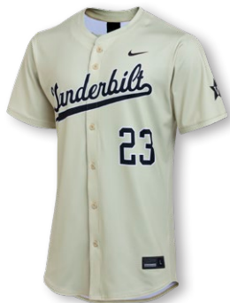
NIKE DIGITAL VAPOR PREMIER FB JERSEY DX9130 Page 6