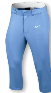
NEW NIKE STOCK VAPOR SELECT2 HIGH PANT DX9152 Page 20