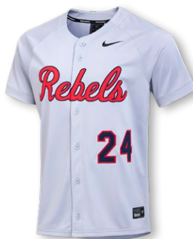
NEW NIKE CUSTOM VAPOR SELECT2 FB JERSEY DX9050 Page 13