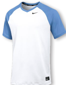
NEW NIKE STOCK VAPOR SELECT2 V-NECK JERSEY DX9140 Page 19