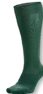
NIKE 2PPK BASEBALL SOCK SX4810 Page 26