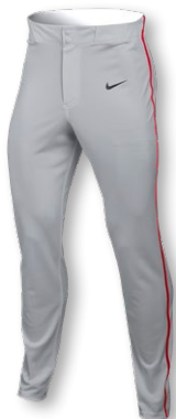
NEW NIKE STOCK VAPOR SELECT2 PIPED PANT DX9155 Page 21