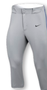
NIKE STOCK VAPOR SELECT2 HIGH PIPED PANT DX9139 Page 24