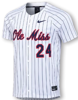
NIKE DIGITAL VAPOR SELECT2 FB JERSEY DX9126 Page 9