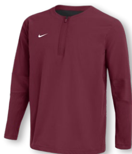
NEW NIKE DF LIGHTWEIGHT PLAYER PO HQ5959 Page 26