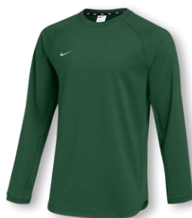
NEW NIKE STOCK LS PRE-GAME TOP HQ5878 Page 26