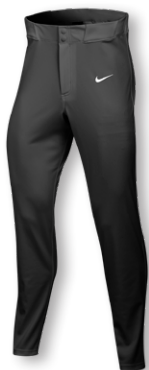
NIKE STOCK VAPOR SELECT2 PANT DX9154 Page 23