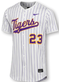
NIKE CUSTOM VAPOR PREMIER FB JERSEY DX9029 Page 13