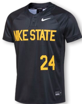
NIKE DIGITAL VAPOR SELECT2 JERSEY DX9138 Page 10