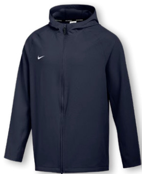
NIKE STOCK THERMA-FIT PRE-GAME JACKET FV8177 Page 25