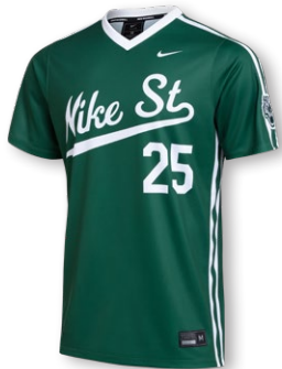
NEW NIKE DIGITAL THROWBACK JERSEY HQ5919 Page 11