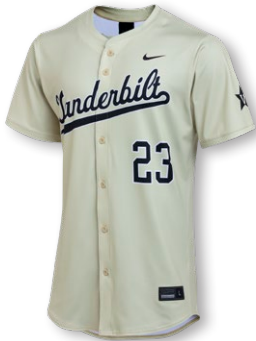
NIKE DIGITAL VAPOR PREMIER FB JERSEY DX9130 Page 7