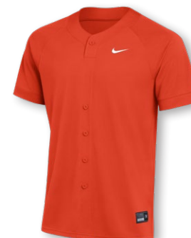
NEW NIKE STOCK GAPPER JERSEY HQ5885 Page 22