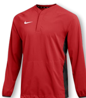
NIKE STOCK LS WINDSHIRT D09174 Page 29