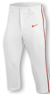
NIKE CUSTOM VAPOR PREMIER HIGH PANT DX9077 Page 17