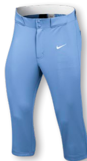
NIKE STOCK VAPOR SELECT2 HIGH PANT DX9152 Page 23