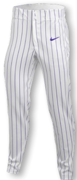
NIKE CUSTOM VAPOR PREMIER PANT DX9082 Page 17