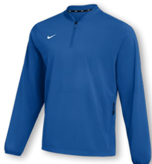
NEW NIKE STOCK LS WINDSHIRT HQ5842 Page 28