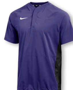
NIKE STOCK SS WINDSHIRT D09175 Page 29