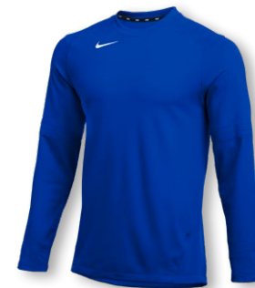
NIKE STOCK LS CREW PRE-GAME TOP CT4050 Page 27