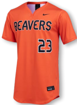
NIKE DIGITAL VAPOR PREMIER JERSEY DX9127 Page 8