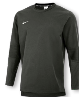
NIKE DF LIGHTWEIGHT PULLOVER FD4291 Page 27