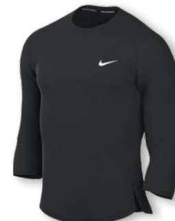
NIKE STOCK DF 3QT TOP D09173 Page 30