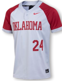
NIKE CUSTOM VAPOR SELECT2 2B JERSEY DX9065 Page 16