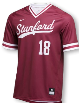
NIKE DIGITAL THROWBACK JERSEY AA9769 Page 12