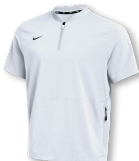
NEW NIKE STOCK SS WINDSHIRT HQ5843 Page 28