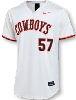
NIKE CUSTOM VAPOR PREMIER JERSEY DX9045 Page 14