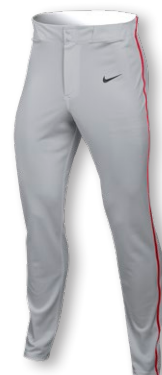
NIKE STOCK VAPOR SELECT2 PIPED PANT DX9155 Page 24