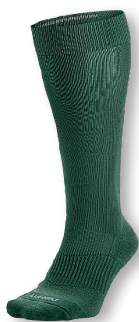
NIKE 2PPK BASEBALL SOCK SX4810 Page 31