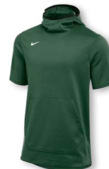
NIKE STOCK DF SPOTLIGHT SS PULLOVER HOODIE DC2521 Page 24