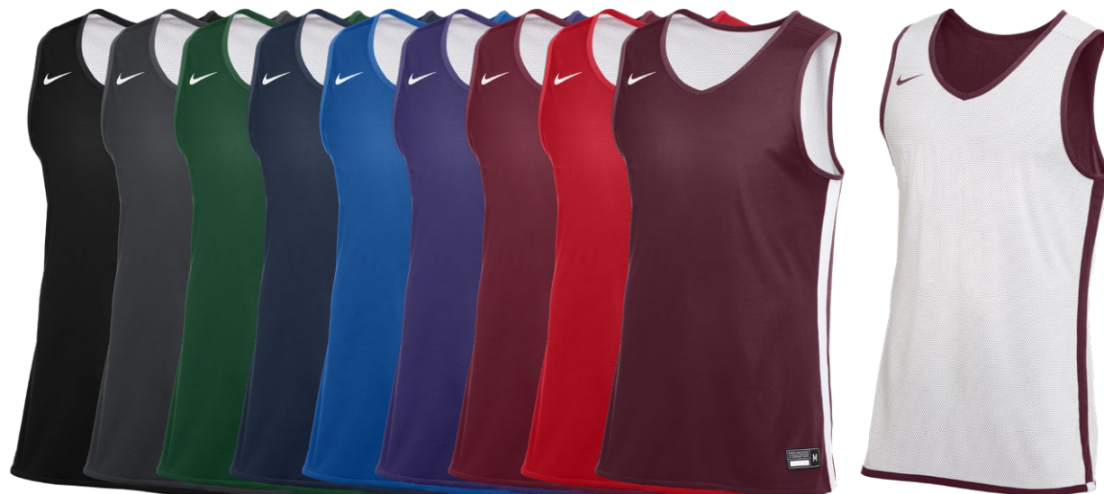
SINGLE LAYER CONSTRUCTION