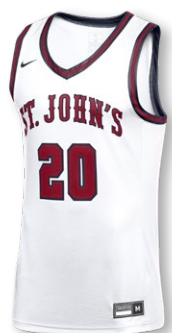
NIKE DIGITAL DF JUMPER JERSEY DZ4666 Page 8