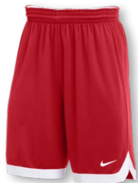
NIKE STOCK PRACTICE SHORT 2 CQ4364 Page 15