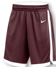
NIKE STOCK BOARD REVERSIBLE PRACTICE SHORT DZ4802 Page 14