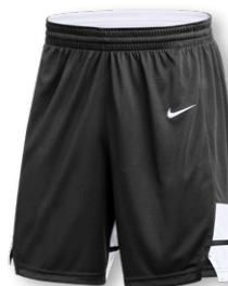
NIKE STOCK DF OVERTIME SHORT DN6643 Page 16