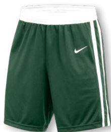
NIKE STOCK BLOCK SHORT DZ4835 Page 13