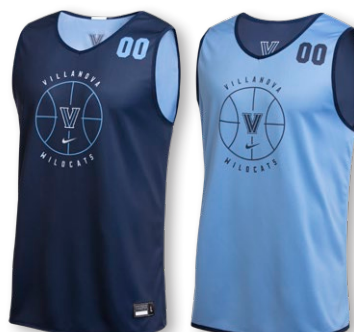
NIKE DIGITAL DF REVERSIBLE MESH BUCKET JERSEY DN5420 Page 11