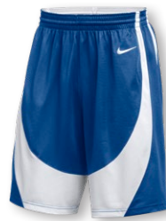
NIKE STOCK DF PRACTICE DISH SHORT DN5214 Page 19