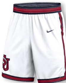
NIKE DIGITAL DF JUMPER SHORT DZ4667 Page 8