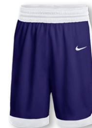
NIKE STOCK DF CROSSOVER SHORT DC2324 Page 17