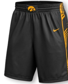
NIKE DIGITAL DF HYPERELITE QUICK SHORT DN6437 Page 9