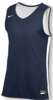
NIKE STOCK PRACTICE JERSEY 2 CQ4362 Page 18