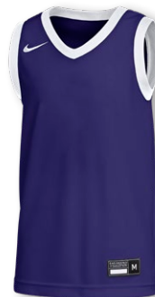
NIKE STOCK DF CROSSOVER JERSEY DC2322 Page 17