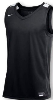
NIKE STOCK DF OVERTIME JERSEY DN6594 Page 16