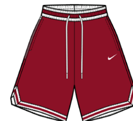
NEW NIKE STOCK DF DNA TEAM SHORT FQ5219 Page 15