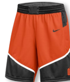
NIKE DIGITAL DF LAYUP SHORT DZ4660 Page 7