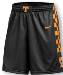
NIKE DIGITAL DF DUNK SHORT DZ4656 Page 6