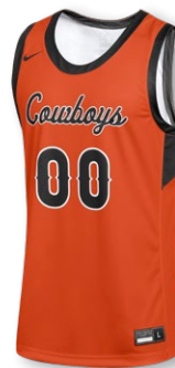
NIKE DIGITAL DF LAYUP JERSEY DZ4657 Page 7