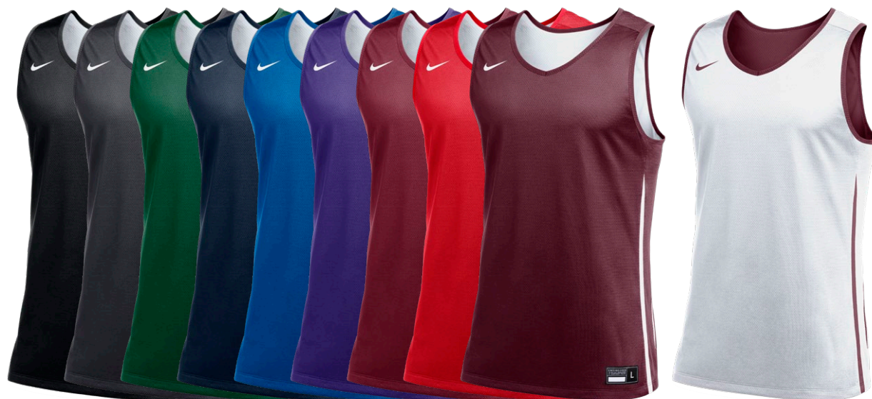
DOUBLE LAYER CONSTRUCTION