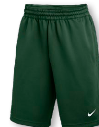
NIKE STOCK DF SPOTLIGHT 2 SHORT DC2517 Page 24