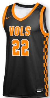
NIKE DIGITAL DF DUNK JERSEY DZ4655 Page 6