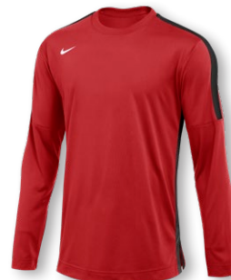
NIKE STOCK DF LS SHOOTING SHIRT DC3251 Page 23