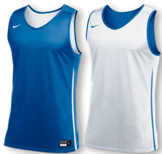
NIKE STOCK DF PRACTICE DISH JERSEY DN5212 Page 19