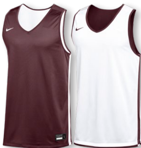
NIKE STOCK BOARD REVERSIBLE PRACTICE JERSEY DZ4804 Page 14