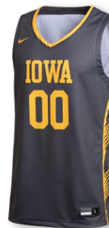
NIKE DIGITAL DF HYPERELITE QUICK JERSEY DN6431 Page 9