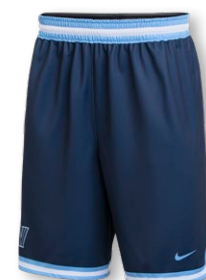
NIKE DIGITAL DF MESH BUCKET SHORT DN5748 Page 11