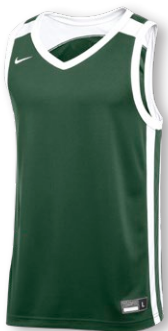
NIKE STOCK BLOCK JERSEY DZ4833 Page 13