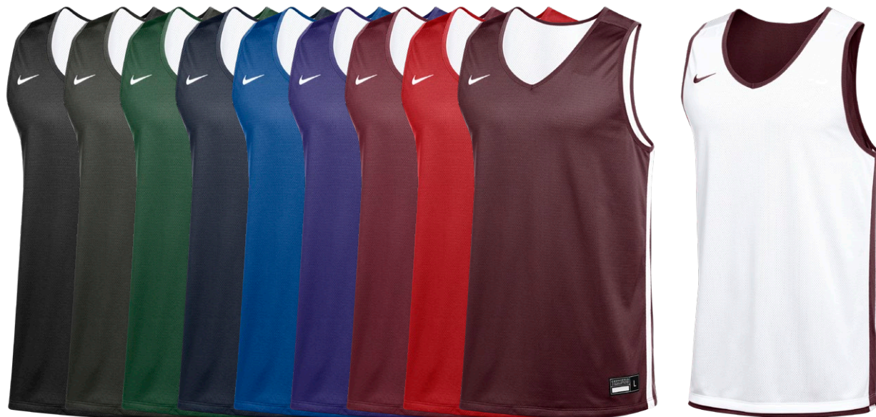
DOUBLE LAYER CONSTRUCTION