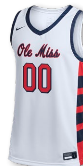
NIKE DIGITAL DF ELITE POWER JERSEY DN6471 Page 13