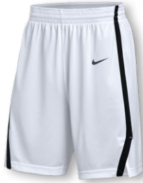
NEW NIKE STOCK PINNACLE GAME SHORT HM9685 Page 16