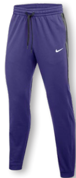
NIKE SHOWTIME PANT FD1133 Page 29