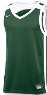
NIKE STOCK BLOCK JERSEY DZ4833 Page 17