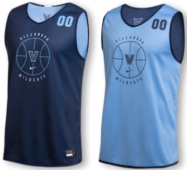
NIKE DIGITAL DF REVERSIBLE MESH BUCKET JERSEY DN5420 Page 14