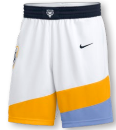
NIKE CUSTOM DF ELITE BOUNCE SHORT DN5327 Page 15