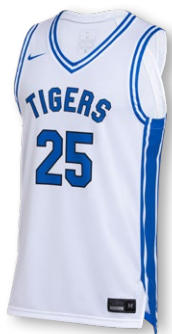
NEW NIKE DIGITAL HYPERELITE COURT JERSEY HM9681 Page 9