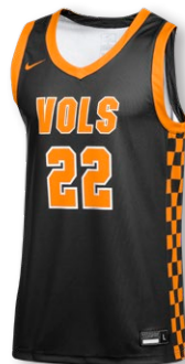
NIKE DIGITAL DF DUNK JERSEY DZ4655 Page 8