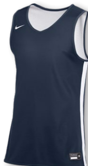
NIKE STOCK PRACTICE JERSEY 2 CQ4362 Page 25