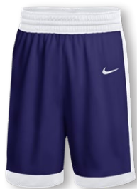
NIKE STOCK DF CROSSOVER SHORT DC2324 Page 24