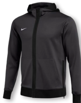
NIKE THERMAFLEX SHOWTIME FULL ZIP HOODIE DC2445 Page 27