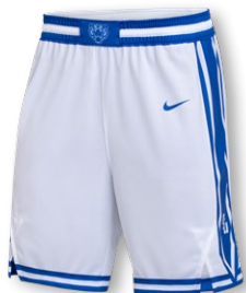
NEW NIKE DIGITAL HYPERELITE COURT SHORT HM9683 Page 9