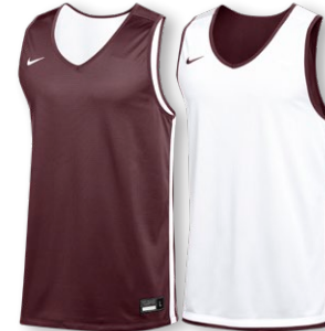
NIKE STOCK BOARD REVERSIBLE PRACTICE JERSEY DZ4804 Page 18