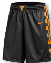
NIKE DIGITAL DF DUNK SHORT DZ4656 Page 8