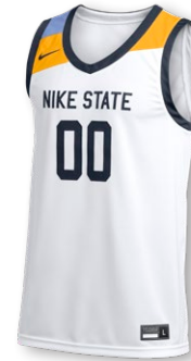
NIKE CUSTOM DF ELITE BOUNCE JERSEY DN5278 Page 15