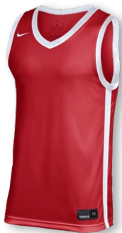
NEW NIKE STOCK ELITE GAME JERSEY HM9947 Page 22