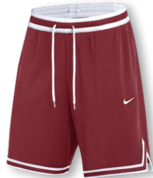
NIKE STOCK DF DNA TEAM SHORT FQ5219 Page 19