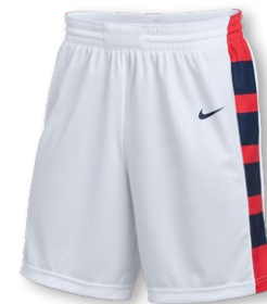
NIKE DIGITAL DF ELITE POWER SHORT DN6473 Page 13