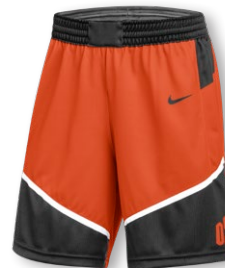
NIKE DIGITAL DF LAYUP SHORT DZ4660 Page 10