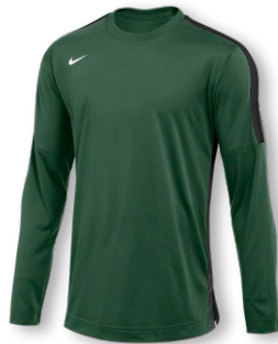
NIKE STOCK DF LS SHOOTING SHIRT DC3251 Page 30