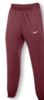
NIKE STOCK TFLX SNAP PANT DDZ4687 Page 28