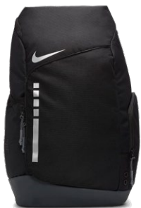
NIKE HOOPS ELITE BACKPACK DX9786 Page 32