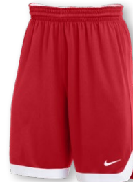
NIKE STOCK PRACTICE SHORT 2 CQ4364 Page 20