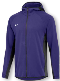
NIKE SHOWTIME FULL ZIP HOODIE FD1132 Page 29