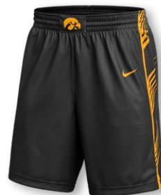
NIKE DIGITAL DF HYPERELITE QUICK SHORT DN6437 Page 12