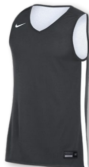
NEW NIKE STOCK ELITE PRACTICE JERSEY HM9957 Page 23