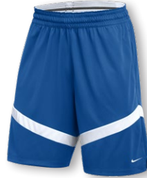
NEW NIKE STOCK ELITE ICON SHORT HM9958 Page 20