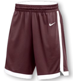
NIKE STOCK BOARD REVERSIBLE PRACTICE SHORT DZ4802 Page 18