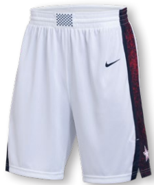
NEW NIKE DIGITAL PINNACLE SLAM SHORT HM9684 Page 7