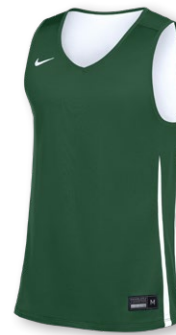
NEW NIKE STOCK HYPERELITE PRACTICE JERSEY HM9960 Page 23