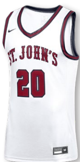
NIKE DIGITAL DF JUMPER JERSEY DZ4666 Page 11