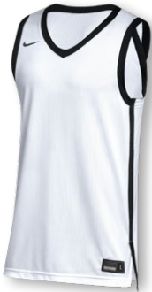
NEW NIKE STOCK PINNACLE GAME JERSEY HM9682 Page 16