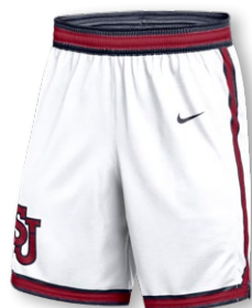
NIKE DIGITAL DF JUMPER SHORT DZ4667 Page 11