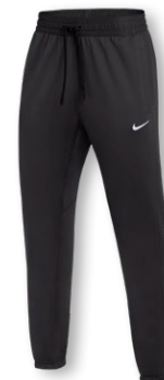
NIKE THERMAFLEX SHOWTIME PANT DC2446 Page 27