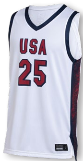
NEW NIKE DIGITAL PINNACLE SLAM JERSEY HM9680 Page 7