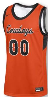
NIKE DIGITAL DF LAYUP JERSEY DZ4657 Page 10