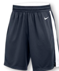
NIKE STOCK PICK PRACTICE SHORT DZ4810 Page 25