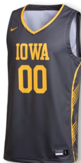
NIKE DIGITAL DF HYPERELITE QUICK JERSEY DN6431 Page 12