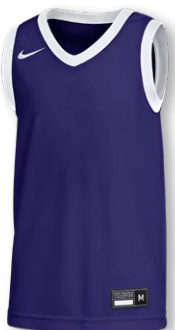
NIKE STOCK DF CROSSOVER JERSEY DC2322 Page 24