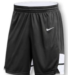
NIKE STOCK DF OVERTIME SHORT DN6643 Page 21