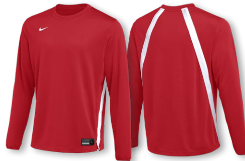
NEW NIKE STOCK LS WARM-UP TOP HM9959 Page 31