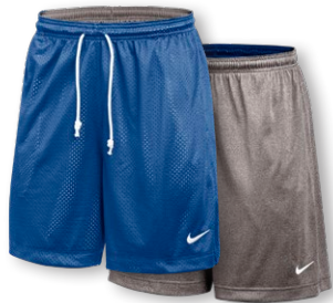
NIKE STOCK STANDARD ISSUE REVERSIBLE SHORT DZ4688 Page 19