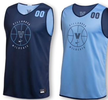
NIKE DIGITAL DF REVERSIBLE MESH BUCKET JERSEY DN5420 Page 17