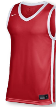
NIKE STOCK ELITE GAME JERSEY HM9947 Page 23