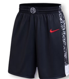
NEW NIKE DIGITAL ELITE HIGHLIGHT SHORT II1501 Page 13