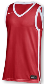
NIKE STOCK PINNACLE GAME JERSEY HM9682 Page 19