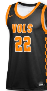
NIKE DIGITAL DF DUNK JERSEY DZ4655 Page 10