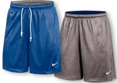
NIKE STOCK STANDARD ISSUE REVERSIBLE SHORT DZ4688 Page 24