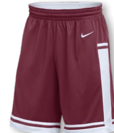
NEW NIKE STOCK ELITE CONNECT SHORT II1562 Page 25