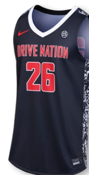
NEW NIKE DIGITAL ELITE HIGHLIGHT JERSEY II1500 Page 13