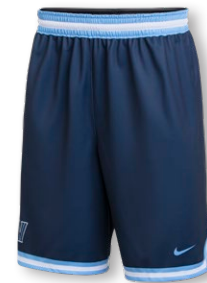
NIKE DIGITAL DF MESH BUCKET SHORT DN5748 Page 17