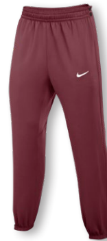
NIKE STOCK TFLX SNAP PANT DZ4687 Page 29