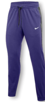
NIKE SHOWTIME PANT FD1133 Page 30