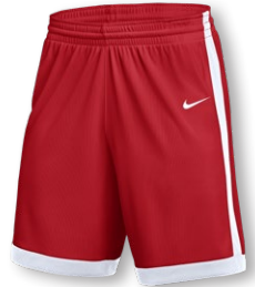
NIKE STOCK ELITE GAME SHORT HM9956 Page 23