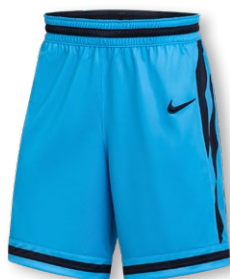
NEW NIKE DIGITAL ELITE CLASSIC SHORT II1499 Page 14