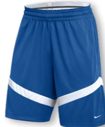
NIKE STOCK ELITE ICON SHORT HM9958 Page 25