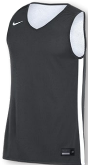
NIKE STOCK ELITE PRACTICE JERSEY HM9957 Page 26