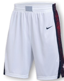
NIKE DIGITAL PINNACLE SLAM SHORT HM9684 Page 9