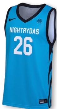
NEW NIKE DIGITAL ELITE CLASSIC JERSEY II1498 Page 14