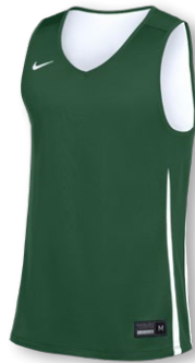
NIKE STOCK HYPERELITE PRACTICE JERSEY HM9960 Page 26