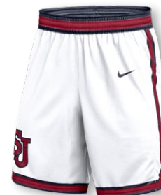
NIKE DIGITAL DF JUMPER SHORT DZ4667 Page 15