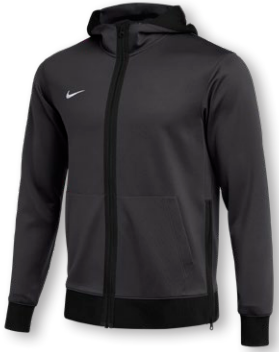
NIKE THERMAFLEX SHOWTIME FULL ZIP HOODIE DC2445 Page 28