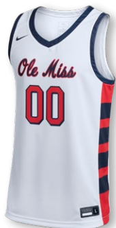
NIKE DIGITAL DF ELITE POWER JERSEY DN6471 Page 16