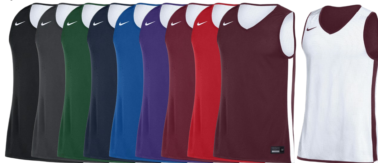
SINGLE LAYER CONSTRUCTION