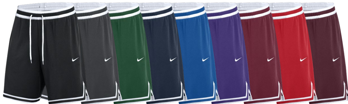
SIDE SEAM POCKETS WITH ZIPPERS

Help your players move freely on the court and beyond in the Nike Dri-FIT DNA Shorts. Made from breathable fabric, they have a loose fit, lightweight feel and sweat-wicking technology. Nike Dri-FIT technology moves sweat away from your skin for quicker evaporation, helping you stay dry and comfortable. Lightweight fabric feels soft and breathable. Elastic waistband stretches for comfort and adjusts with a drawcord. Striped waistband. Shorts have side seam pockets with zippers. Great for practice, travel and training. Hip width: 23.75" (size large), Inseam length: 8" (all sizes). Offered in +1" length options.