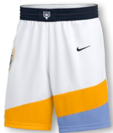
NIKE CUSTOM DF ELITE BOUNCE SHORT DN5327 Page 18