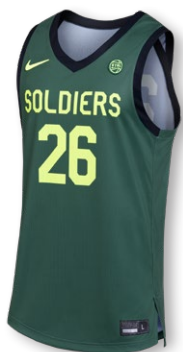
NEW NIKE DIGITAL GAME JERSEY II1299 Page 8