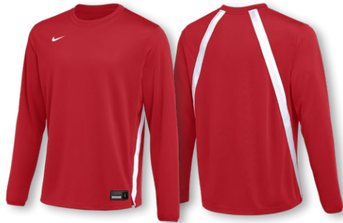
NIKE STOCK LS WARM-UP TOP HM9959 Page 31