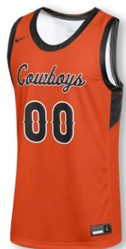
NIKE DIGITAL DF LAYUP JERSEY DZ4657 Page 12