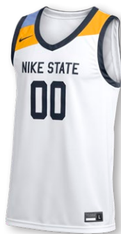
NIKE CUSTOM DF ELITE BOUNCE JERSEY DN5278 Page 18