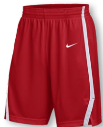
NIKE STOCK PINNACLE GAME SHORT HM9685 Page 19