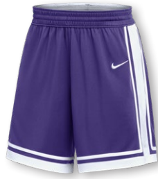
NEW NIKE STOCK ELITE PRO SHORT II1559 Page 21