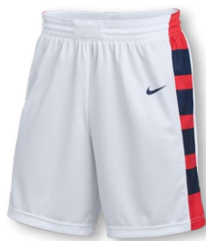
NIKE DIGITAL DF ELITE POWER SHORT DN6473 Page 16