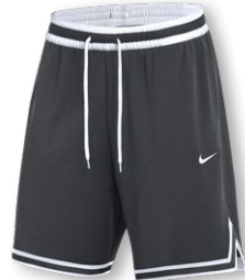
NIKE STOCK DF DNA TEAM SHORT FQ5219 Page 24