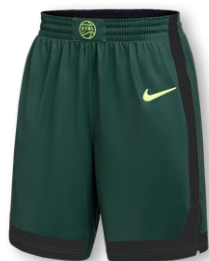
NEW NIKE DIGITAL GAME SHORT II1300 Page 8