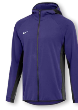
NIKE SHOWTIME FULL ZIP HOODIE FD1132 Page 30