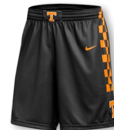
NIKE DIGITAL DF DUNK SHORT DZ4656 Page 10