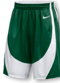
NIKE STOCK DF PRACTICE DISH SHORT DN5214 Page 27