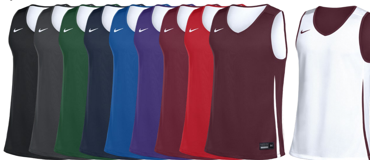
DOUBLE LAYER CONSTRUCTION