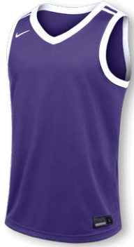
NEW NIKE STOCK ELITE PRO JERSEY II1558 Page 21