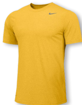
NIKE TEAM LEGEND SS CREW DV7299 Page 23