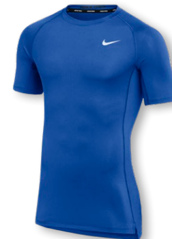
NIKE PRO TIGHT SS TRAINING TOP DH4800 Page 33