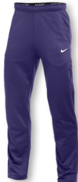
NIKE THERMA PANT REGULAR CN9483 Page 11