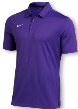
NIKE DRI-FIT FRANCHISE POLO CI4470 Page 26