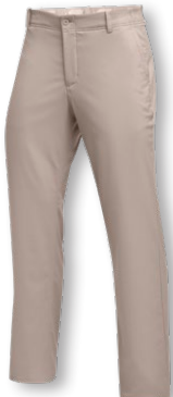
NIKE TEAM FLEX PANT CU9429 Page 37