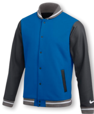
NIKE STOCK LETTERMAN JACKET DJ5971 Page 27