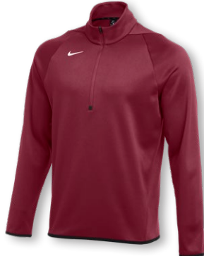
NIKE THERMA LS 1/4-ZIP TOP CN9492 Page 13