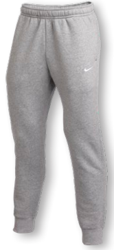
NIKE TEAM CLUB PANT CJ1616 Page 15