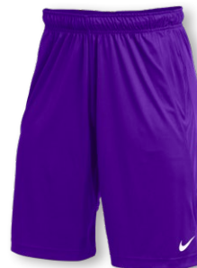
NIKE TEAM KNIT SHORT CU3460 Page 40