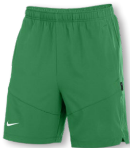
NIKE DF PLAYER POCKET SHORT CW5409 Page 38