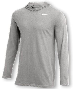
NIKE DF LONG SLEEVE HOODIE TEE CJ1696 Page 20