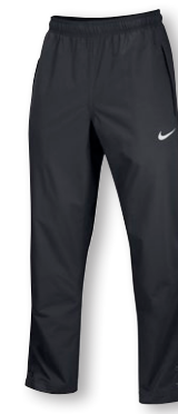
NIKE WATERPROOF PANT DA4984 Page 29