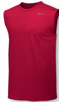
NIKE TEAM LEGEND SL CREW DV7307 Page 23