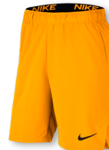
NIKE TEAM DF FLEX WOVEN SHORT DJ8686 Page 39