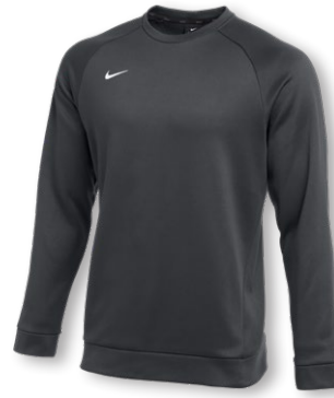
NIKE THERMA CREW CN9511 Page 14