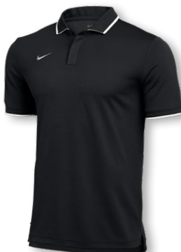
NIKE DF POLO UV COLLEGIATE CW3415 Page 25