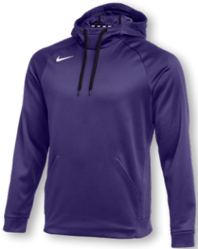
NIKE THERMA PULLOVER HOODIE CN9473 Page 11