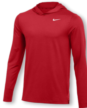
NIKE TEAM HYPER DF LONG SLEEVE TOP CU9458 Page 19