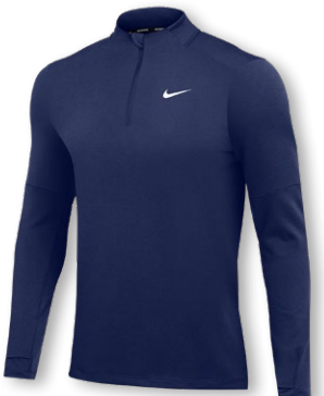
NIKE DRI-FIT ELEMENT 1/2-ZIP TOP DH4949 Page 17