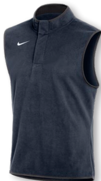
NIKE THERMA VEST DA4965 Page 30