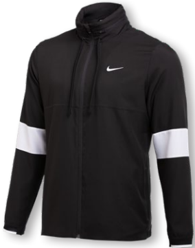
NIKE DRI-FIT JACKET CV0094 Page 9