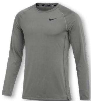
NIKE PRO SLIM LS TRAINING TOP DH4788 Page 32