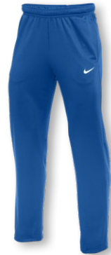
NIKE EPIC KNIT PANT 2.0 CN9470 Page 12