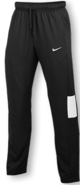
NIKE DRI-FIT PANT CV0096 Page 9