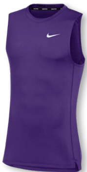
NIKE PRO SLEEVELESS TRAINING TOP DH4796 Page 33