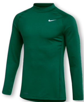
NIKE PRO MOCK-NECK LS TRAINING TOP DH4806 Page 32