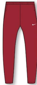
NIKE TEAM MILER REPEL PANT DH8110 Page 10