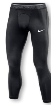
NIKE PRO 3/4 TRAINING TIGHT DH4780 Page 36