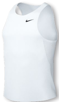
NIKE PRO DRI-FIT COMPRESSION TANK DZ4690 Page 34