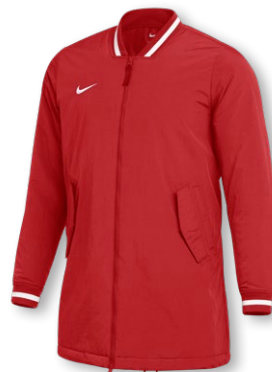
NIKE STOCK DUGOUT JACKET DC9103 Page 28