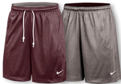
NIKE STOCK STANDARD ISSUE REVERSIBLE SHORT DZ4688 Page 39