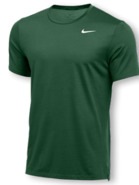
NIKE TEAM HYPER DF SHORT SLEEVE TOP CU9468 Page 19