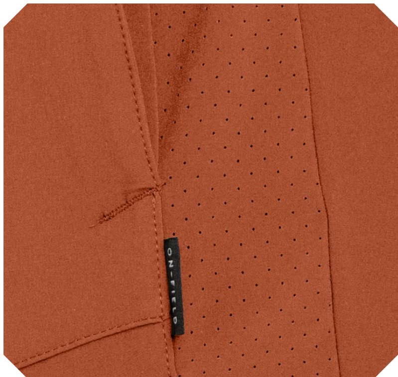
SIDE INSET DETAIL