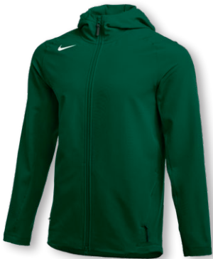
NIKE STOCK THERMA LS PRE-GAME FZ HOODIE CT2693 Page 13