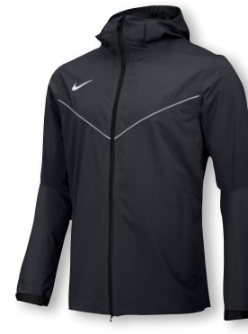
NIKE WATERPROOF JACKET DA4967 Page 29