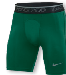
NIKE PRO TRAINING COMPRESSION SHORT DH4762 Page 36