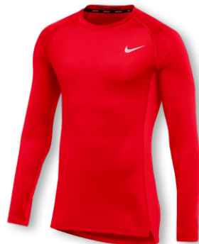
NIKE PRO TIGHT LS TRAINING TOP DH4791 Page 32