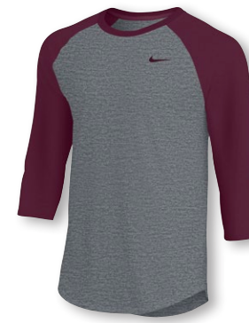
NIKE DF 3/4 SLEEVE RAGLAN TOP CJ1617 Page 26