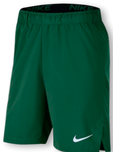
NIKE TEAM DF FLEX WOVEN SHORT NO POCKETS DJ8693 Page 49