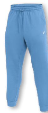
NEW NIKE TEAM PRIMARY PANT HF6927 Page 14