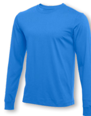
NIKE CORE LS COTTON CREW CJ1690 Page 29