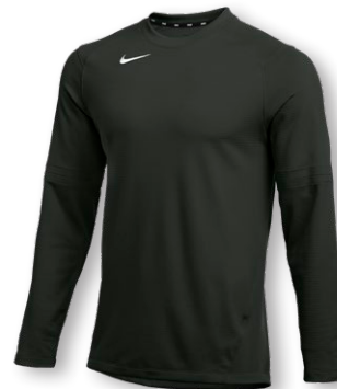
NIKE STOCK LS CREW PRE-GAME TOP CT4050 Page 26