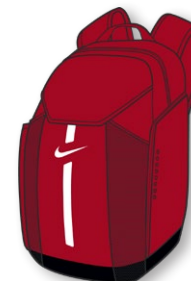
NIKE ACADEMY TEAM BACKPACK DC2647 Page 51