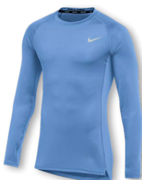
NIKE PRO TIGHT LS TRAINING TOP DH4791 Page 38