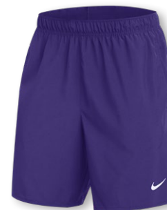
NEW NIKE TEAM CHALLENGER SHORT UNLINED HF6934 Page 45