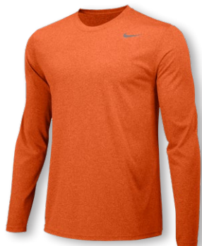
NIKE TEAM LEGEND LS CREW DV7298 Page 27