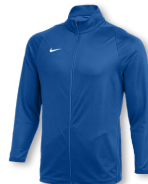
NIKE EPIC KNIT JACKET 2.0 CN9409 Page 17