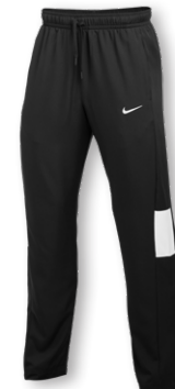
NIKE DRI-FIT PANT CV0096 Page 12