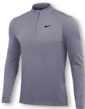
NIKE DRI-FIT ELEMENT 1/2-ZIP TOP DH4949 Page 21