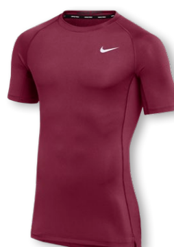
NIKE PRO TIGHT SS TRAINING TOP DH4800 Page 39