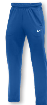
NIKE EPIC KNIT PANT 2.0 CN9470 Page 17