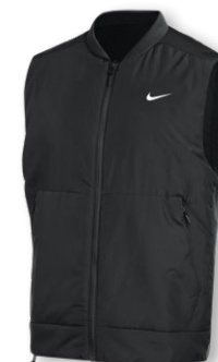
NEW NIKE STOCK UNLIMITED VEST HM6892 Page 35