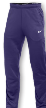
NIKE THERMA PANT REGULAR CN9483 Page 16