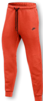
NIKE TECH FLEECE JOGGER FQ1884 Page 10