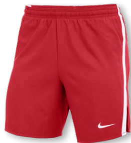
NIKE STOCK FAST 7IN SHORT CV2941 Page 49