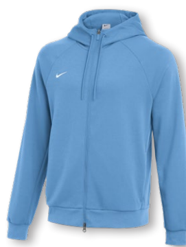
NEW NIKE TEAM PRIMARY HD FZ HF6926 Page 14