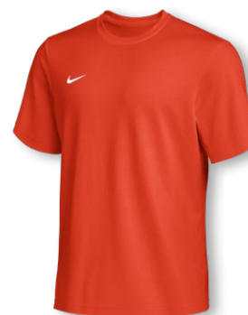
NEW NIKE TEAM PRIMARY SS HF6915 Page 23