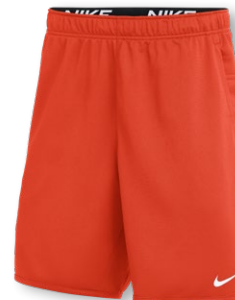
NEW NIKE TEAM TOTALITY KNIT SHORT UNLINED HF6932 Page 48