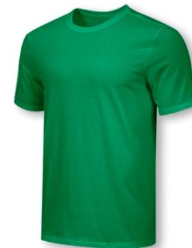
NIKE CORE SS COTTON CREW CJ1693 Page 29