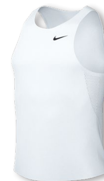
NIKE PRO DRI-FIT COMPRESSION TANK DZ4690 Page 40