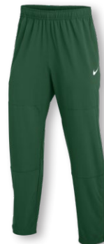
NEW NIKE TEAM PANT DRY WOVEN HF6931 Page 11