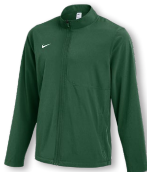
NEW NIKE TEAM FZ JACKET DRY WOVEN HF6930 Page 11