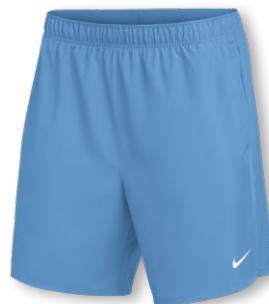
NEW NIKE TEAM CHALLENGER 2N1 SHORT HF6933 Page 45