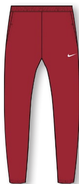
NIKE TEAM MILER REPEL PANT DH8110 Page 13