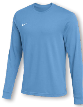
NEW NIKE TEAM PRIMARY LS HF6916 Page 23