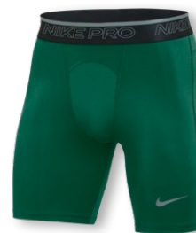
NIKE PRO TRAINING COMPRESSION SHORT DH4762 Page 42