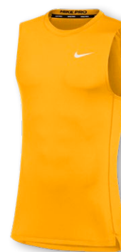
NIKE PRO SLEEVELESS TRAINING TOP DH4796 Page 39