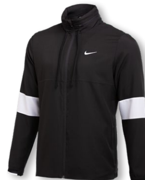
NIKE DRI-FIT JACKET CV0094 Page 12