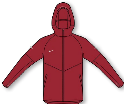
NIKE TEAM MILER REPEL JACKET DH8109 Page 13