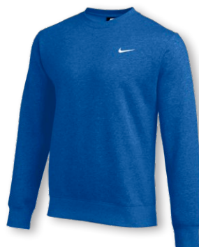
NIKE TEAM CLUB CREW CJ1614 Page 19