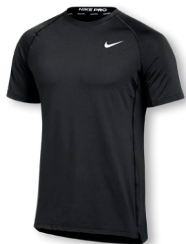
NIKE PRO SLIM SS TRAINING TOP DH4798 Page 37