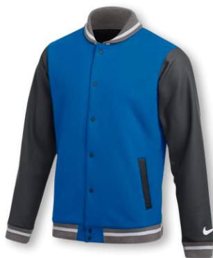
NIKE STOCK LETTERMAN JACKET DJ5971 Page 32