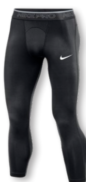
NIKE PRO 3/4 TRAINING TIGHT DH4780 Page 42