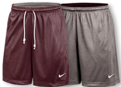
NIKE STOCK STANDARD ISSUE REVERSIBLE SHORT DZ4688 Page 44