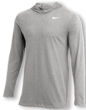
NIKE DF LONG SLEEVE HOODIE TEE CJ1696 Page 25