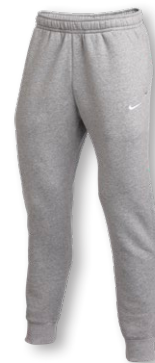
NIKE TEAM CLUB PANT CJ1616 Page 19