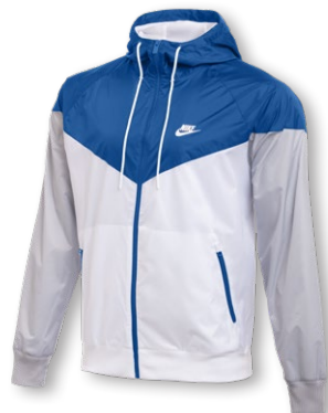
NIKE TEAM WINDRUNNER JACKET HD CU9474 Page 36