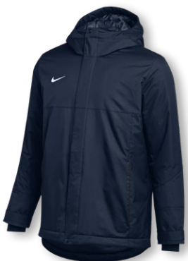
NEW NIKE TEAM DOWN FILL PARKA HF7143 Page 28