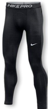
NIKE PRO WARM TRAINING TIGHT DH4802 Page 37