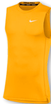
NIKE PRO SLEEVELESS TRAINING TOP DH4796 Page 35