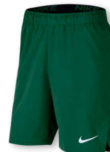
NIKE TEAM DF FLEX WOVEN SHORT NO POCKETS DJ8693 Page 43