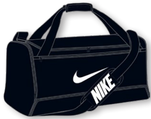
NIKE BRASILIA LARGE DUFFEL 9.5 D09193 Page 44