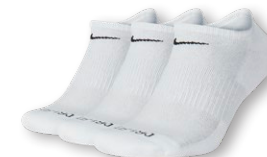
NIKE EVERYDAY PLUS CUSHION NO SHOW 3PPK SX6889 Page 46