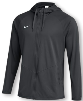
NIKE TEAM FZ HD RELENTLESS JACKET HF6935 Page 13