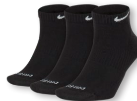
NIKE EVERYDAY PLUS CUSHION LOW 3PPK SX7040 Page 46