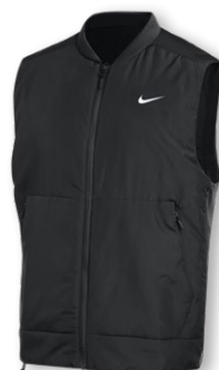
NIKE STOCK UNLIMITED VEST HM6892 Page 29