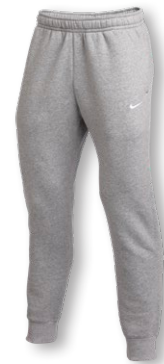
NIKE TEAM CLUB PANT CJ1616 Page 16