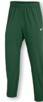
NIKE TEAM PANT DRY WOVEN HF6931 Page 10