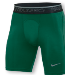
NIKE PRO TRAINING COMPRESSION SHORT DH4762 Page 38