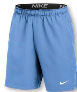
NIKE DF FLEX WOVEN SHORT 7" FQ1885 Page 41