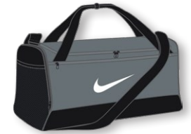
NIKE BRASILIA SMALL DUFFEL 9.5 DM3976 Page 44