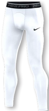
NIKE PRO TRAINING TIGHT DH4769 Page 37