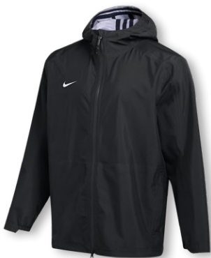
NEW NIKE TEAM WATERPROOF RAIN JACKET HF7146 Page 30