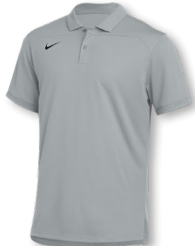
NEW NIKE DRI-FIT UV COLLEGIATE POLO HF7129 Page 26