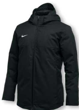
NIKE TEAM DOWN FILL PARKA DJ6526 Page 29