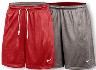
NIKE STOCK STANDARD ISSUE REVERSIBLE SHORT DZ4688 Page 39