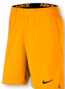
NIKE TEAM DF FLEX WOVEN SHORT DJ8686 Page 42