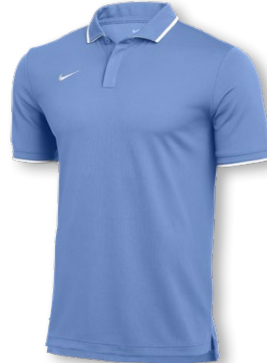
NIKE DF POLO UV COLLEGIATE CW3415 Page 27