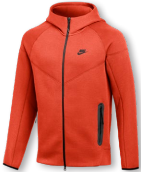
NIKE TECH FLEECE FZ WINDRUNNER FQ1883 Page 9