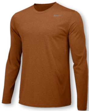
NIKE TEAM LEGEND LS CREW DV7298 Page 22