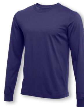
NIKE CORE LS COTTON CREW CJ1690 Page 24