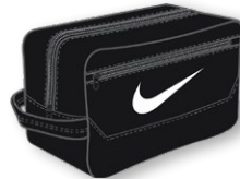
NIKE BRASILIA SHOE BAG 9.5 DM3982 Page 45