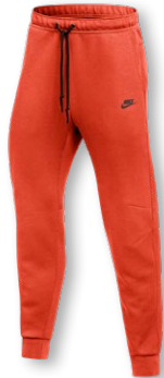
NIKE TECH FLEECE JOGGER FQ1884 Page 9