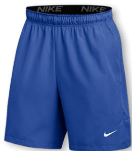
NIKE TEAM DF FLEX WOVEN SHORT 7" NO POCKETS FQ3687 Page 42