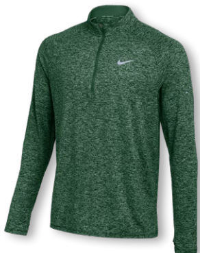
NEW NIKE DRI-FIT STRIDE HZ MIDLAYER TOP IF2264 Page 18