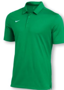
NIKE DRI-FIT FRANCHISE POLO CI4470 Page 27