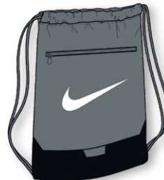
NIKE BRASILIA DRAWSTRING 9.5 DM3978 Page 45