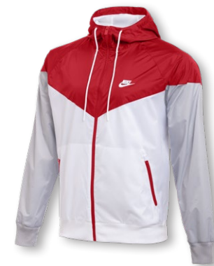
NIKE TEAM WINDRUNNER JACKET HD CU9474 Page 32