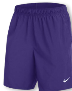
NIKE TEAM CHALLENGER SHORT UNLINED HF6934 Page 40