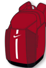
NIKE ACADEMY TEAM BACKPACK DC2647 Page 45