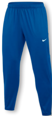
NIKE DRI-FIT ELEMENT PANT DH4950 Page 19