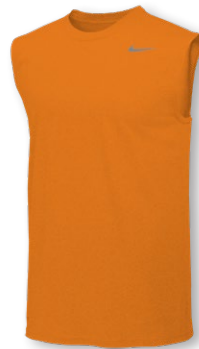
NIKE TEAM LEGEND SL CREW DV7307 Page 23