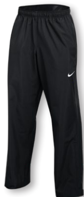
NEW NIKE TEAM WATERPROOF RAIN PANT HF7136 Page 30