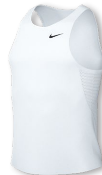
NIKE PRO DRI-FIT COMPRESSION TANK DZ4690 Page 36