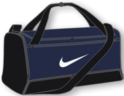
NIKE BRASILIA XSMALL DUFFEL 9.5 DM3977 Page 44