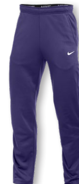
NIKE THERMA PANT REGULAR CN9483 Page 14