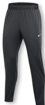
NIKE TEAM FL RELENTLESS PANT HF6939 Page 13