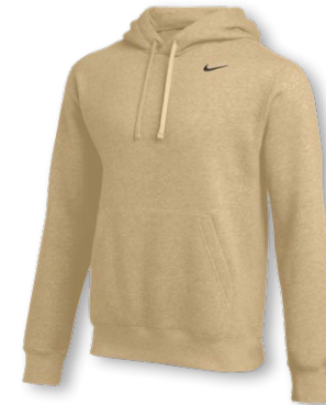
NIKE TEAM CLUB PULLOVER HOODIE CJ1611 Page 17