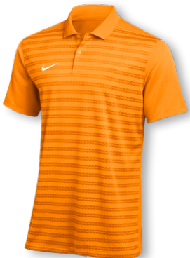
NIKE DRI-FIT COACHES VICTORY POLO SS FJ9553 Page 25