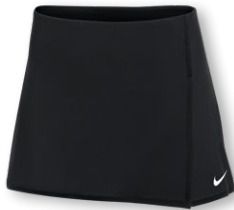
NEW NIKE TEAM DRI-FIT VICTORY SKIRT FZ5746 Page 7