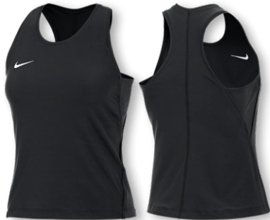
NEW NIKE TEAM DRI-FIT VICTORY TANK FZ5745 Page 7