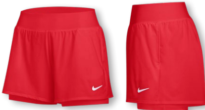
NIKECOURT VICTORY FLEX SHORT DH4922 Page 8