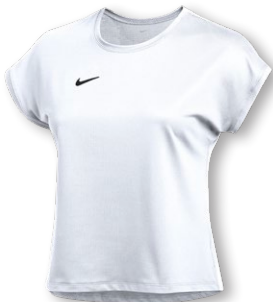
NIKECOURT DRI-FIT VICTORY SS TOP DV3495 Page 8