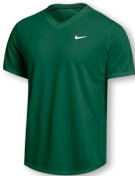
NIKECOURT DRI-FIT VICTORY TOP DH4934 Page 4