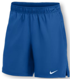
NEW NIKECOURT DRI-FIT SHORT 7IN FZ5652 Page 5