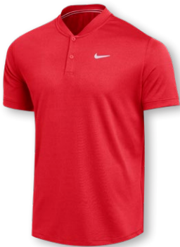
NIKECOURT DRI-FIT POLO DH4933 Page 4