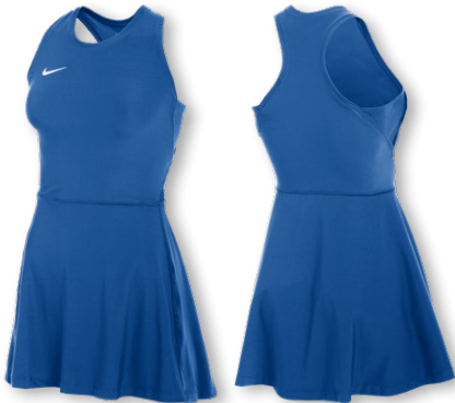
NEW NIKE DRI-FIT VICTORY DRESS FZ5747 Page 6