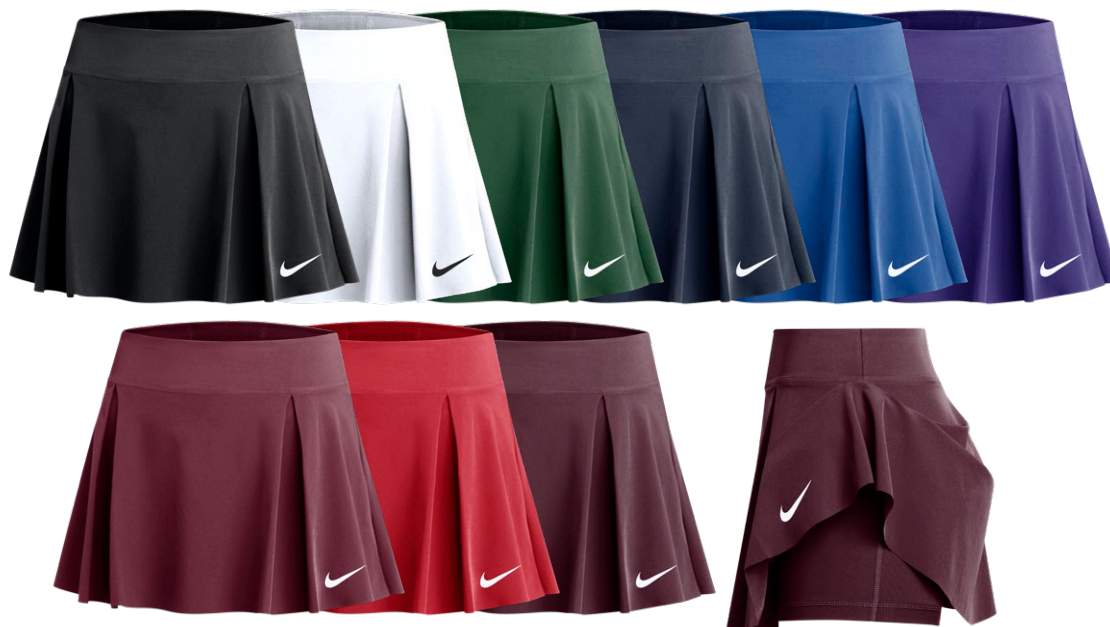
SIDE VIEW SHOWING INNER SHORTS