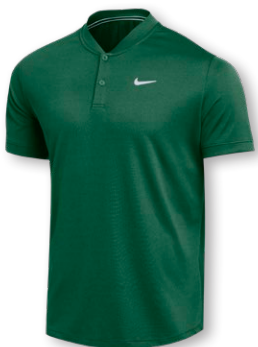
NIKECOURT DRI-FIT POLO DH4933 Page 5