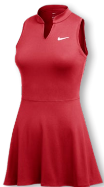
NEW NIKECOURT DF VICTORY DRESS DV3490 Page 7