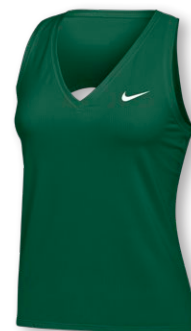
NIKECOURT DF TANK DH4926 Page 9