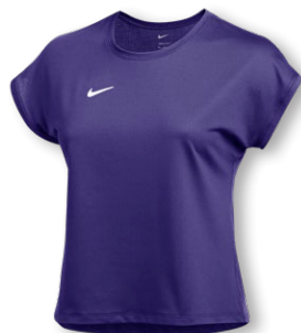
NEW NIKECOURT DF VICTORY SS TOP DV3495 Page 8