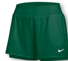
NIKECOURT VICTORY FLEX SHORT DH4922 Page 9