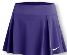
NEW NIKECOURT DF ADVANTAGE SKIRT DV3498 Page 8