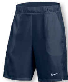
NIKECOURT FLEX SHORT 9IN DH4935 Page 6