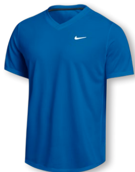
NIKECOURT DRI-FIT VICTORY TOP DH4934 Page 5