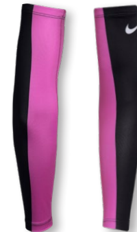
NEW NIKE DIGITAL ACE ARM SLEEVE IF2153 Page 13