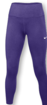
NEW NIKE STOCK MATCH VB 7/8 TIGHT HM6878 Page 24