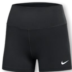
NEW NIKE STOCK MATCH VB 5IN SHORT HM6877 Page 26