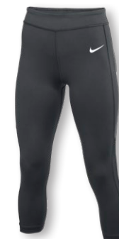
NIKE STOCK CLUB ACE CAPRI CZ1448 Page 25