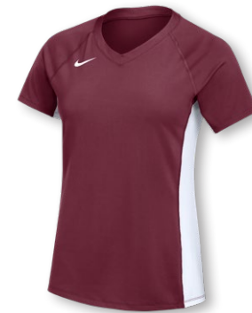
NEW NIKE STOCK ACE JERSEY SS IF2147 Page 20