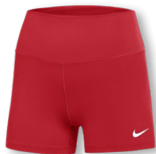
NEW NIKE STOCK MATCH VB 3IN SHORT HM6876 Page 26