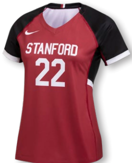
NIKE DIGITAL ELITE SS JERSEY DJ8615 Page 9