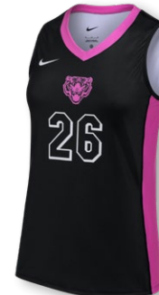
NEW NIKE DIGITAL ACE JERSEY SL IF2128 Page 12