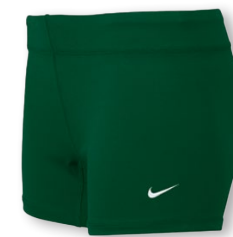
NIKE PERFORMANCE GAME SHORT 108720 Page 28