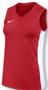
NEW NIKE STOCK ACE JERSEY SL IF2288 Page 21