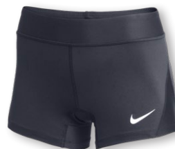
NIKE STOCK HYPERELITE SHORT BV1020 Page 27