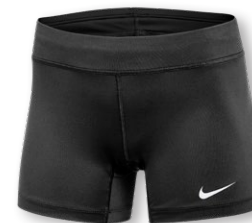
NIKE CUSTOM PERFORMANCE GAME SHORT FD0203 Page 15