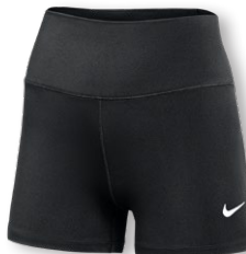
NEW NIKE CUSTOM MATCH VB 3IN SHORT HM6879 Page 15