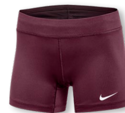
NIKE 5" PERFORMANCE GAME SHORT DV6740 Page 27