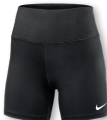
NEW NIKE CUSTOM MATCH VB 5IN SHORT HM6893 Page 15