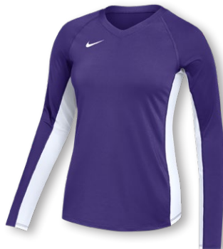
NEW NIKE STOCK ACE JERSEY LS IF2142 Page 18