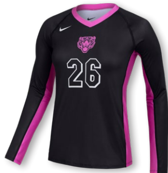
NEW NIKE DIGITAL ACE JERSEY LS IF2131 Page 10