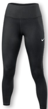
NEW NIKE CUSTOM MATCH VB 7/8 TIGHT HM6885 Page 14