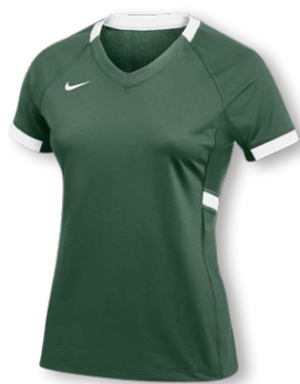
NIKE STOCK ELITE SS JERSEY DJ8627 Page 17