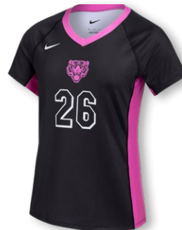
NEW NIKE DIGITAL ACE JERSEY SS IF2137 Page 11