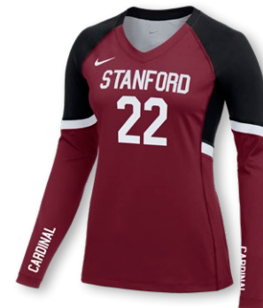
NIKE DIGITAL ELITE LS JERSEY DJ8535 Page 8