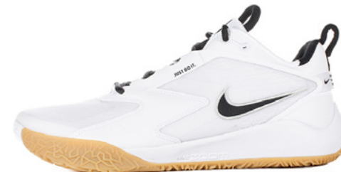
101 WHITE/BLACK-PHOTON DUST