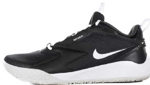
002 BLACK/WHITE-PHOTON DUST