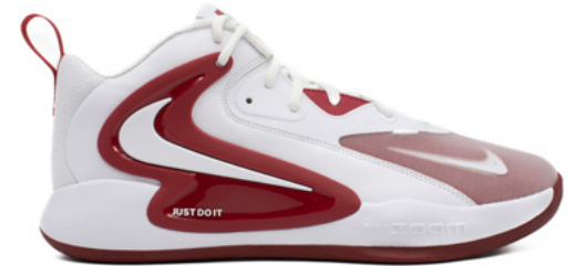
106 WHITE/WHITE-TEAM CRIMSON