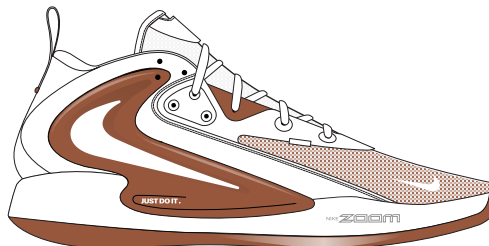
105 WHITE/WHITE-DESERT ORANGE