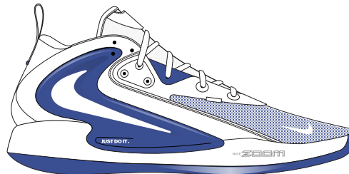
108 WHITE/WHITE-GAME ROYAL