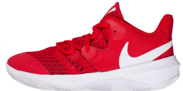
610 UNI RED/WHITE