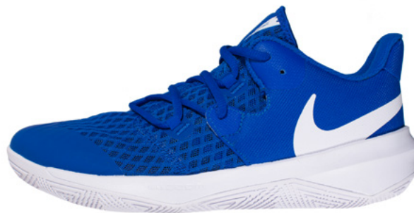
410 GAME ROYAL/WHITE