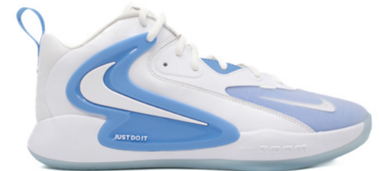
100 WHITE/WHITE-VALOR BLUE