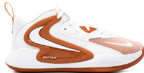
105 WHITE/WHITE-DESERT ORANGE