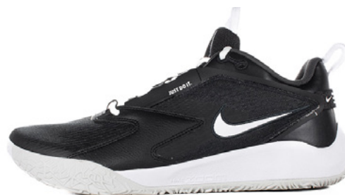
002 BLACK/WHITE-PHOTON DUST