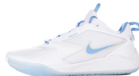
103 WHITE/VALOR BLUE-PHOTON DUST