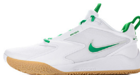
102 WHITE/APPLE GREEN-PHOTON DUST