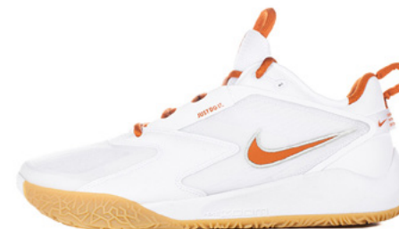
104 WHITE/DESERT ORANGE-PHTN DUST