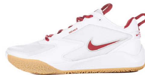
100 WHITE/TEAM CRIMSON-PHOTON DUST