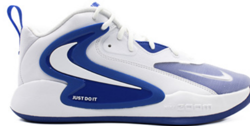
108 WHITE/WHITE-GAME ROYAL