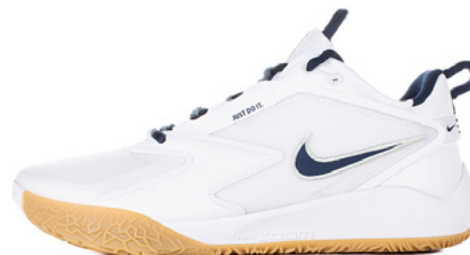
107 WHITE/COLLEGE NAVY-PHOTON DUST