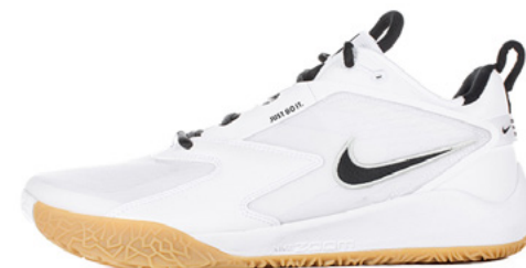
101 WHITE/BLACK-PHOTON DUST