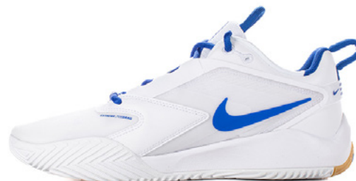
106 WHITE/GAME ROYAL-PHOTON DUST