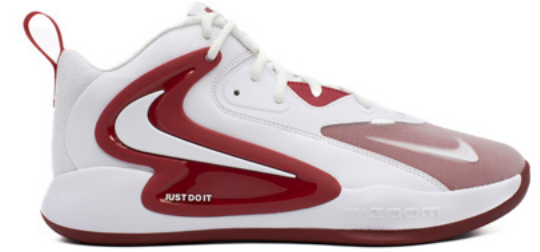
106 WHITE/WHITE-TEAM CRIMSON