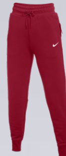
NIKE TEAM TECH FLEECE PANT CW7255 Page 6