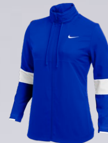
NIKE DRY JACKET CJ1796 Page 7