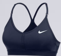
NIKE TEAM INDY V-NECK BRA DJ8523 Page 9