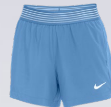
NIKE FLEX 4IN SHORT CW7268 Page 12