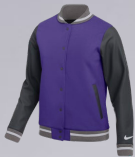
NIKE STOCK LETTERMAN JACKET DJ5972 Page 2