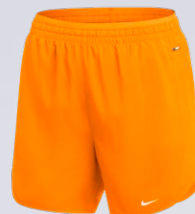
NIKE TEAM TEMPO LUXE 5IN SHORT DJ8528 Page 11