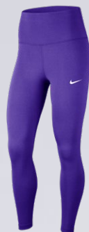
NIKE TEAM YOGA 7/8 TIGHT DJ8524 Page 10