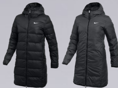
NIKE TEAM WR DOWN FILL PARKA - REVERSIBLE CW7270 Page 3