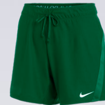
NIKE DRY ATTACK SHORT CJ1786 Page 13