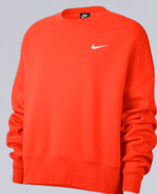
NIKE TEAM FLEECE TREND CREW DJ8525 Page 4