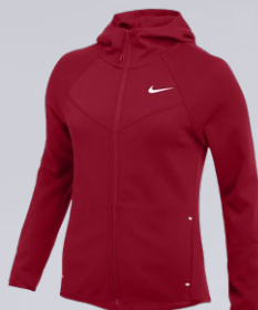
NIKE TEAM TECH FLEECE WR FZ HOODIE CW7220 Page 5