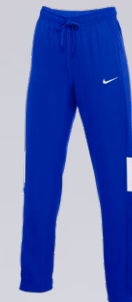
NIKE DRY PANT CJ1805 Page 8