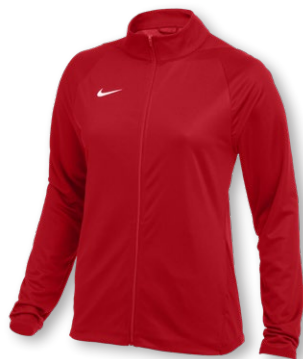
NIKE EPIC KNIT JACKET 2.0 CN9520 Page 13