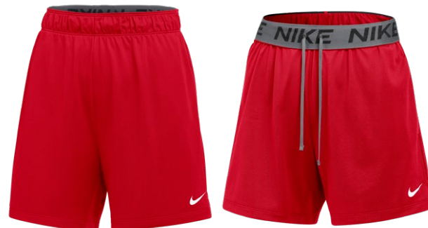
VIEW WITH WAISTBAND DOWN