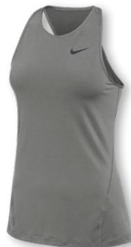
NIKE PRO ALLOVER MESH TANK DH4901 Page 36