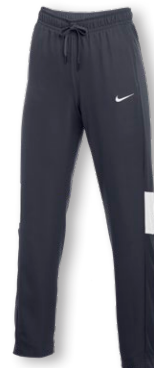
NIKE DRI-FIT PANT CJ1805 Page 10