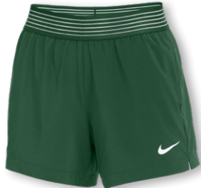
NIKE FLEX 4IN SHORT CW7268 Page 46