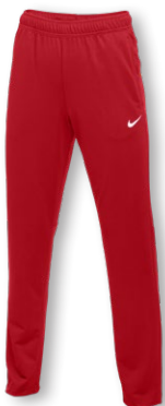
NIKE EPIC KNIT PANT 2.0 CN9523 Page 13