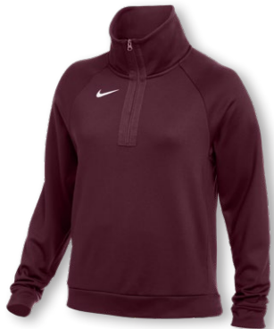
NIKE THERMA ALL TIME MOCK HALF ZIP CN9390 Page 14