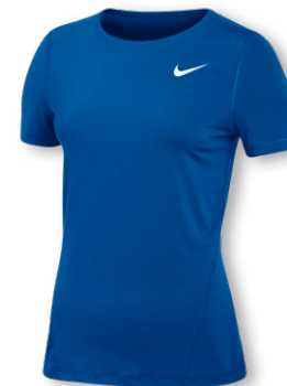
NIKE PRO ALLOVER MESH SS TOP 2.0 DH4905 Page 36