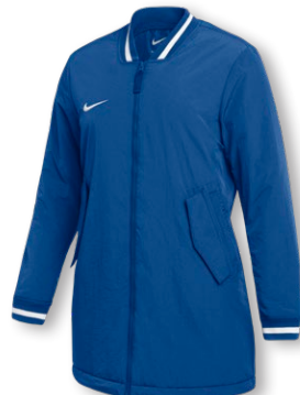
NIKE STOCK DUGOUT JACKET DC9103 Page 32