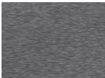
FABRIC DETAIL FOR CARBON HEATHER