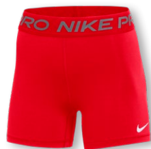
NIKE PRO 365 SHORT 5IN DH4886 Page 40