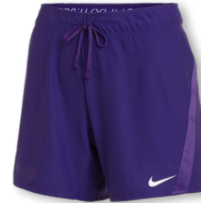
NIKE DRI-FIT ATTACK SHORT CJ1786 Page 47