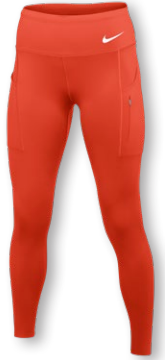
NEW NIKE GO TF MID-RISE 7/8-TIGHT FJ9869 Page 41