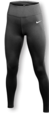
NIKE TEAM ONE MID RISE TIGHT DR5352 Page 43