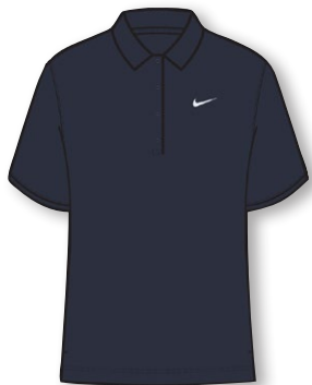
NIKE TEAM DF VICTORY SS POLO DJ8522 Page 29