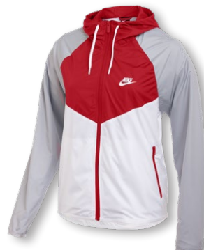
NIKE TEAM WINDRUNNER JACKET CU9550 Page 33