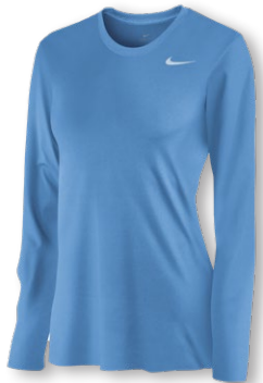
NIKE WMNS LEGEND LS TEE DV7311 Page 26