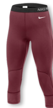
NIKE PRO HYPERCOOL 3QT TIGHT DX9129 Page 39