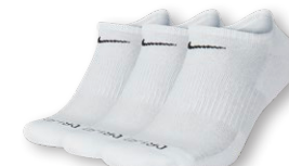
NIKE EVERYDAY PLUS CUSHION NO SHOW 3PPK SX6889 Page 50