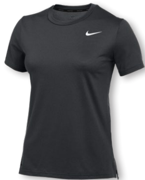
NIKE TEAM HYPER DF SHORT SLEEVE TOP CU9616 Page 19