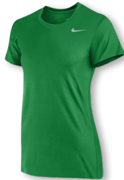
NIKE WMNS LEGEND SS TEE DV7312 Page 27