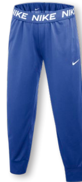
NIKE TEAM ATTACK 7/8 PANT DV6735 Page 44