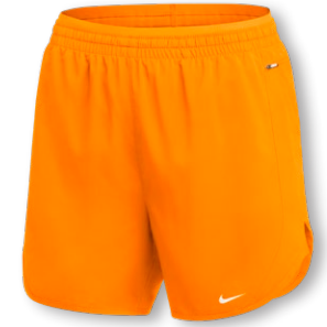
NIKE TEAM TEMPO LUXE 5IN SHORT DJ8528 Page 45