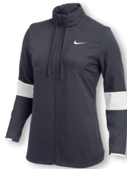
NIKE DRI-FIT JACKET CJ1796 Page 10