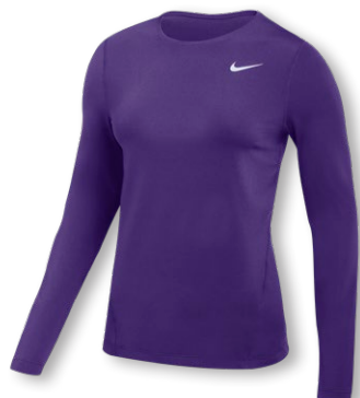
NIKE PRO ALLOVER MESH LS TOP 2.0 DH4902 Page 37