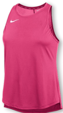
NIKE TEAM ONE DF STD TANK DV6729 Page 22