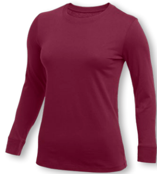
NIKE WMNS CORE LS COTTON CREW CJ1722 Page 28