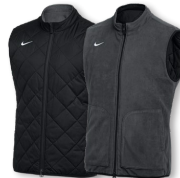
NIKE TEAM REVERSIBLE VEST DR5296 Page 34