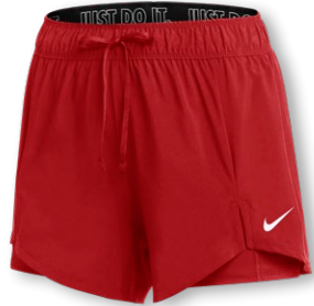
NIKE TEAM DRI-FIT FLEX 2-1 SHORT DJ8680 Page 45