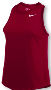
NIKE DRI-FIT HIGH NECK TANK CJ1711 Page 23