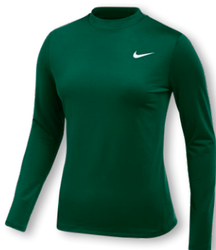
NIKE PRO INTERTWIST TOP 2.0 DH4897 Page 37