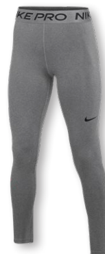
NIKE PRO 365 TIGHT DH4893 Page 38