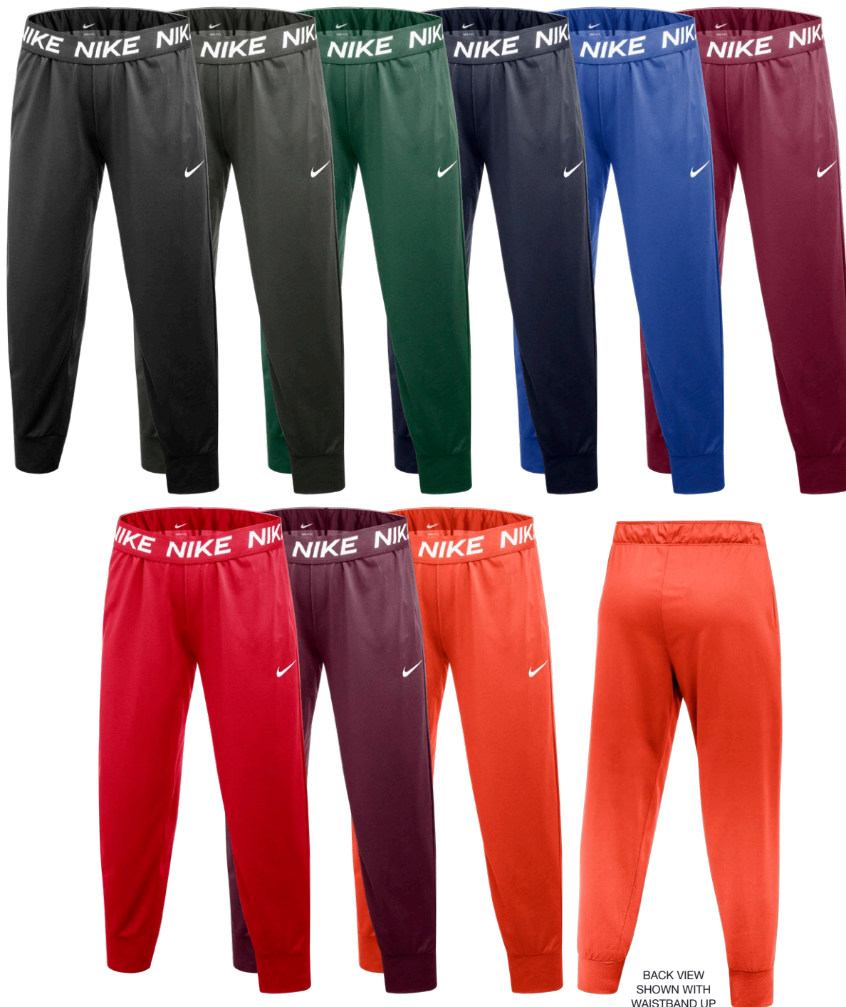
BACK VIEW SHOWN WITH WAISTBAND UP