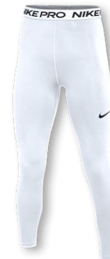
NIKE PRO 365 7/8-LENGTH TIGHT DH4896 Page 38