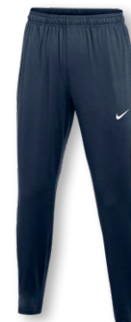
NIKE DRI-FIT ELEMENT PANT DH5183 Page 25