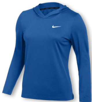
NIKE TEAM HYPER DF LONG SLEEVE TOP CU9619 Page 19