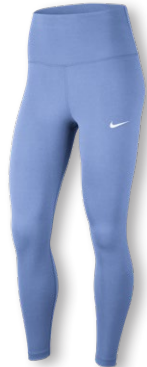
NIKE TEAM YOGA 7/8 TIGHT DJ8524 Page 42