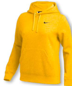
NIKE TEAM CLUB PULLOVER HOODIE CJ1789 Page 17