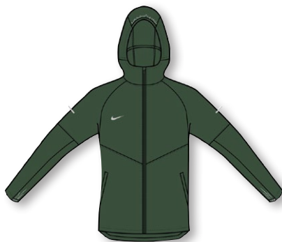
NIKE TEAM MILER REPEL JACKET DH8117 Page 11