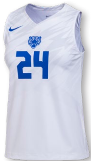
NEW PATTERN NIKE DIGITAL HYPERELITE SL JERSEY BV1011 Page 7