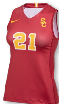
NIKE DIGITAL CLUB ACE SL JERSEY CZ1367 Page 13