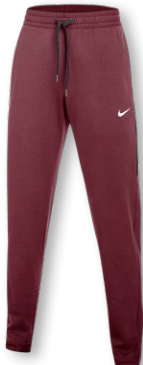
NIKE SHOWTIME PANT FD1646 Page 30