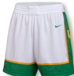
NIKE DIGITAL DF HYPERELITE QUICK SHORT DN5423 Page 11