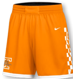
NIKE DIGITAL DF PINNACLE PREMIER SHORT 2 DX9079 Page 9