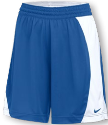
NEW NIKE STOCK ESSENTIAL PRACTICE SHORT HM9058 Page 25