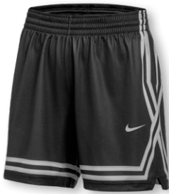
NIKE DIGITAL DF FLY CROSSOVER SHORT DX9088 Page 14