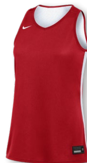
NEW NIKE STOCK ELITE PRACTICE JERSEY HM9056 Page 21