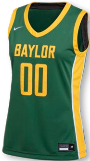
NIKE CUSTOM DF ELITE BOUNCE JERSEY DN5483 Page 15