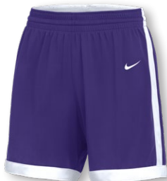
NEW NIKE STOCK ELITE GAME SHORT HM9037 Page 20