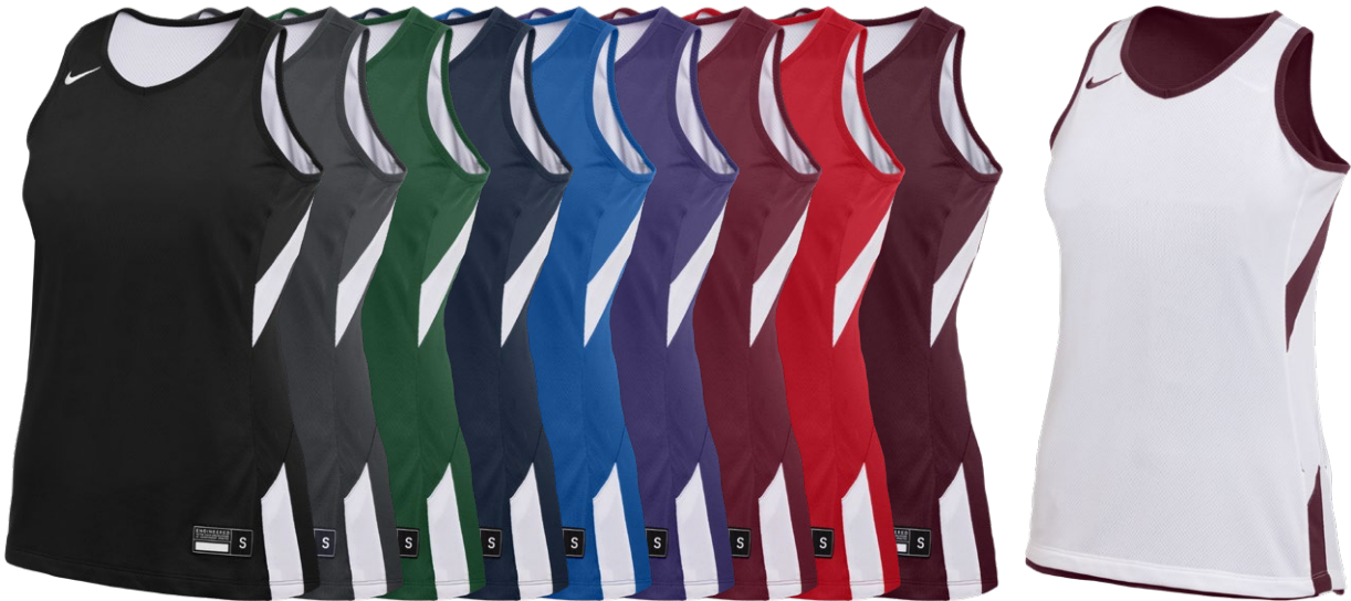
DOUBLE LAYER CONSTRUCTION