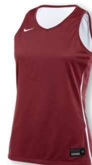
NEW NIKE STOCK HYPERELITE PRACTICE JERSEY HM9052 Page 21