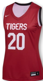
NIKE DIGITAL DF HYPERELITE CHAMP JERSEY 3 DX9051 Page 12