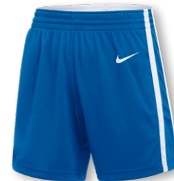
NIKE STOCK DF OVERTIME SHORT DN5597 Page 19