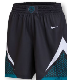
NEW NIKE DIGITAL HYPERELITE COURT SHORT HM9002 Page 8