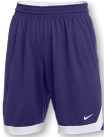
NIKE STOCK PRACTICE SHORT CQ4369 Page 24