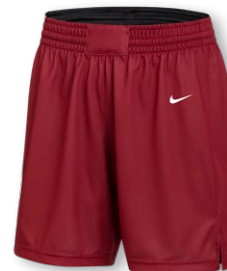
NIKE DIGITAL DF HYPERELITE CHAMP SHORT 3 DX9055 Page 12