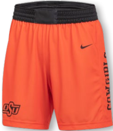
NIKE DIGITAL DF ELITE MIXTAPE SHORT 2 DX9069 Page 13