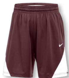
NIKE STOCK DF ISOFLY PRACTICE SHORT DX9125 Page 18