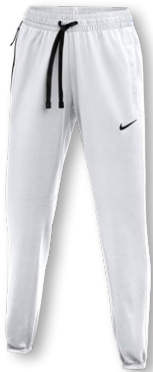
NIKE THERMAFLEX SHOWTIME PANT DC2512 Page 29