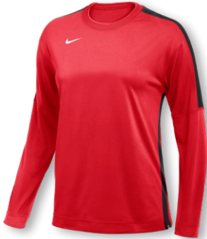
NIKE STOCK DF LS SHOOTING SHIRT DC2535 Page 26