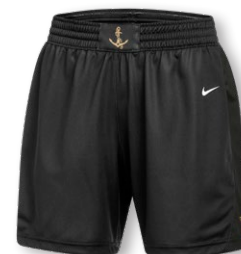
NIKE DIGITAL DF HYPERELITE SHOWCASE SHORT 2 DX9086 Page 10