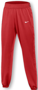
NIKE STOCK THERMAFLEX TEARAWAY PANT DX9128 Page 28