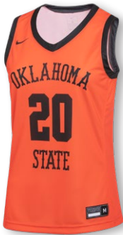
NIKE DIGITAL DF ELITE MIXTAPE JERSEY 2 DX9058 Page 13