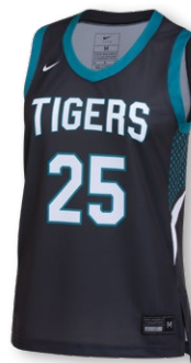
NEW NIKE DIGITAL HYPERELITE COURT JERSEY HM9000 Page 8