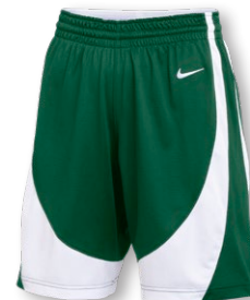
NIKE STOCK DF PRACTICE DISH SHORT DN5249 Page 23