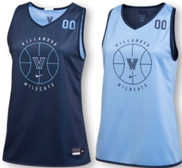
NIKE DIGITAL DF REVERSIBLE MESH BUCKET JERSEY DN5696 Page 14