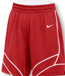
NIKE STOCK DF SWOOSH FLY SHORT DX9091 Page 17