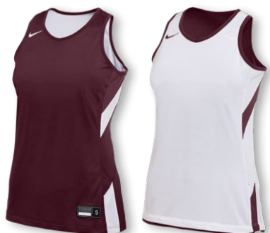
NIKE STOCK PRACTICE JERSEY 1 CQ4366 Page 18