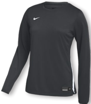
NEW NIKE STOCK LS WARM-UP TOP HM9060 Page 27