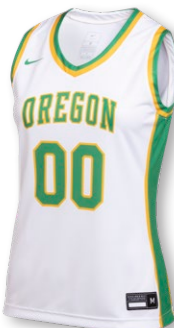
NIKE DIGITAL DF HYPERELITE QUICK JERSEY DN5422 Page 11