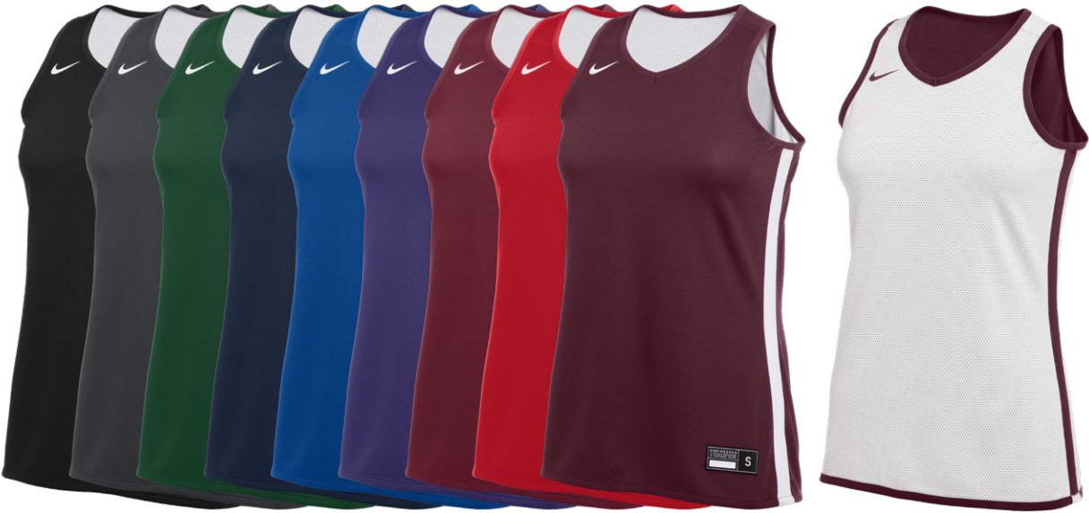
SINGLE LAYER CONSTRUCTION