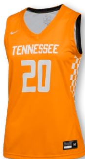
NIKE DIGITAL DF PINNACLE PREMIER JERSEY 2 DX9075 Page 9