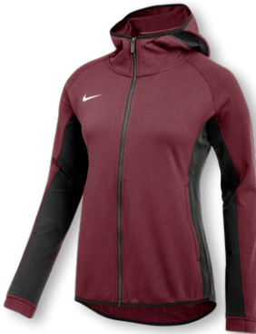
NIKE SHOWTIME FZ HOODIE FD1644 Page 30