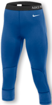
NIKE PRO HYPERCOOL 3QT TIGHT DX9129 Page 31