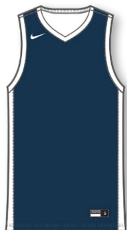
NIKE STOCK DF ELITE 2 JERSEY DC2369 Page 22