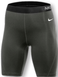
NIKE PRO 8IN SHORT DX9131 Page 31