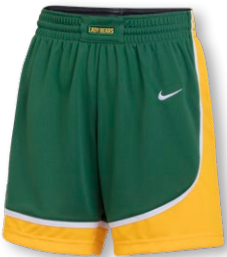
NIKE CUSTOM DF ELITE BOUNCE SHORT DN5559 Page 15