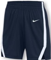
NEW NIKE STOCK PINNACLE GAME SHORT HM9005 Page 16