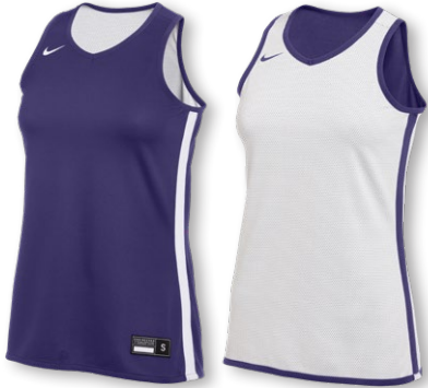
NIKE STOCK REVERSIBLE PRACTICE JERSEY CQ4368 Page 24