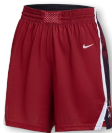
NEW NIKE DIGITAL PINNACLE SLAM SHORT HM8997 Page 7