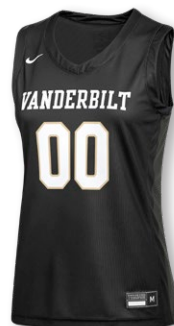
NIKE DIGITAL DF HYPERELITE SHOWCASE JERSEY 2 DX9081 Page 10