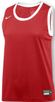
NIKE STOCK DF SWOOSH FLY JERSEY DX9089 Page 17