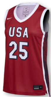
NEW NIKE DIGITAL PINNACLE SLAM JERSEY HM8993 Page 7