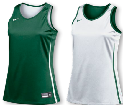
NIKE STOCK DF PRACTICE DISH JERSEY DN5222 Page 23