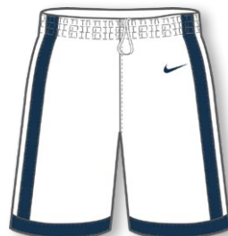
NIKE STOCK DF ELITE 2 SHORT DC2373 Page 22