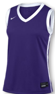
NEW NIKE STOCK ELITE GAME JERSEY HM9031 Page 20