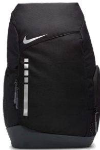
NIKE HOOPS ELITE BACKPACK DX9786 Page 32