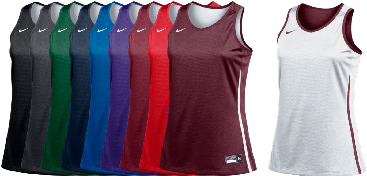
DOUBLE LAYER CONSTRUCTION