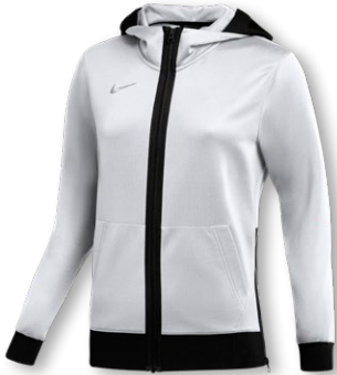
NIKE THERMAFLEX SHOWTIME FZ HOODIE DC2504 Page 29