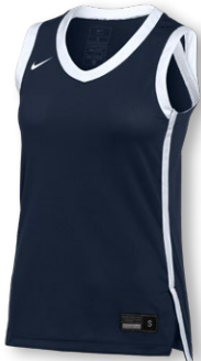
NEW NIKE STOCK PINNACLE GAME JERSEY HM9004 Page 16