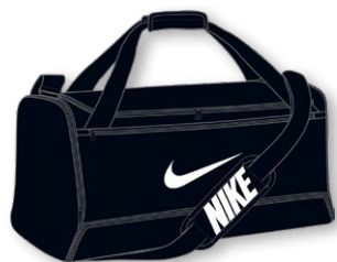
NIKE BRASILIA LARGE DUFFEL 9.5 D09193 Page 59