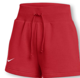
NEW NIKE TEAM SPORTSWEAR PHOENIX SHORT HF6898 Page 20