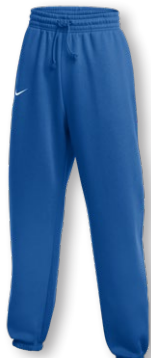
NEW NIKE TEAM SPORTSWEAR PHOENIX PANT HF6897 Page 19