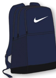
NIKE BRASILIA MEDIUM BACKPACK 9.5 DH7709 Page 59