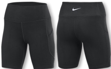
NEW NIKE STOCK DRI-FIT ONE POCKET SHORT HM6891 Page 54