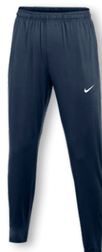
NIKE DRI-FIT ELEMENT PANT DH5183 Page 33