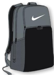
NIKE BRASILIA BACKPACK XL 9.5 DM3975 Page 59