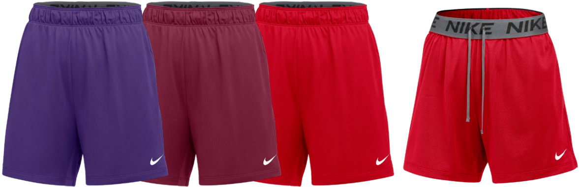
VIEW WITH WAISTBAND DOWN