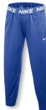
NIKE TEAM ATTACK 7/8 PANT DV6735 Page 53