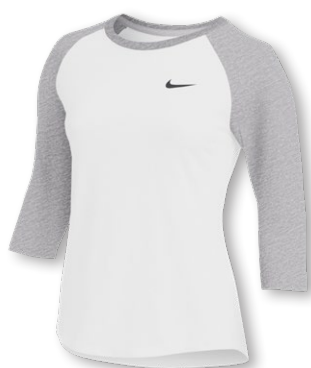
NIKE DRI-FIT 3/4 SLEEVE RAGLAN TOP CJ1703 Page 29