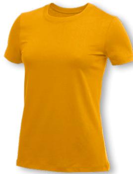
NIKE WMNS CORE SS COTTON CREW CJ1769 Page 37