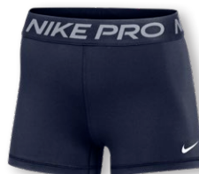
NIKE PRO 365 SHORT 3IN DH4863 Page 47