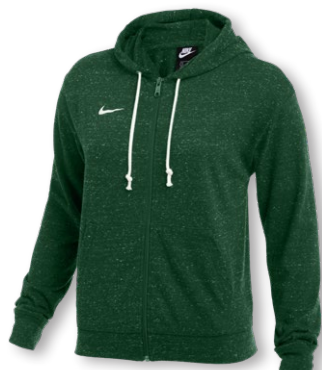
NIKE SPORTSWEAR GYM VINTAGE FZ HOODIE CN9402 Page 22