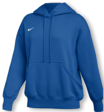
NEW NIKE TEAM SPORTSWEAR PHOENIX HOODIE HF6894 Page 19