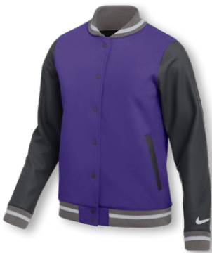
NIKE STOCK LETTERMAN JACKET DJ5972 Page 39