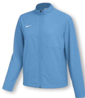
NEW NIKE TEAM FZ JACKET DRY WOVEN HF6901 Page 12