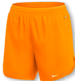
NIKE TEAM TEMPO LUXE 5IN SHORT DJ8528 Page 55