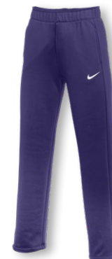
NIKE THERMA ALL TIME PANT CN9394 Page 16