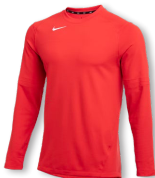
NIKE DRI-FIT PRE-GAME LS TOP DC9106 Page 27