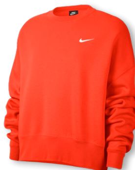
NIKE TEAM FLEECE TREND CREW DJ8525 Page 23