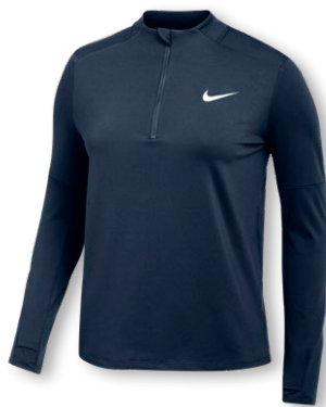
NIKE DRI-FIT ELEMENT 1/2-ZIP TOP DH4951 Page 32