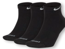
NIKE EVERYDAY PLUS CUSHION LOW 3PPK SX7040 Page 61