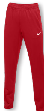
NIKE EPIC KNIT PANT 2.0 CN9523 Page 18