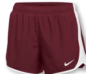
NIKE DRI-FIT TEMPO SHORT 849585 Page 58