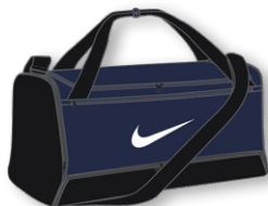
NIKE BRASILIA XSMALL DUFFEL 9.5 DM3977 Page 59