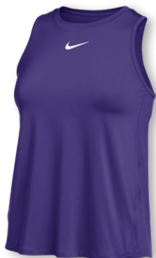
NEW NIKE TEAM ONE DF CLASSIC TANK HF6889 Page 28