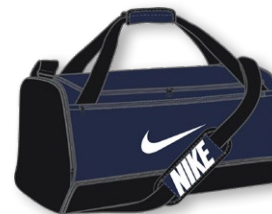
NIKE BRASILIA MEDIUM DUFFEL 9.5 DH7710 Page 59