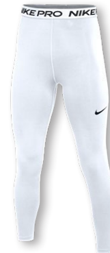
NIKE PRO 365 7/8-LENGTH TIGHT DH4896 Page 45