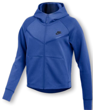
NIKE TEAM TECH FLEECE WINDRUNNER HOODIE FULL ZIP DV6737 Page 11