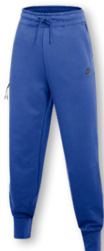
NIKE TEAM TECH FLEECE PANT HR DV6736 Page 11