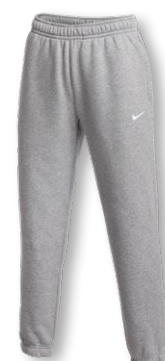
NIKE TEAM CLUB PANT CJ1790 Page 25