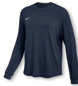
NEW NIKE TEAM ONE RELAXED TOP LS HF6891 Page 27