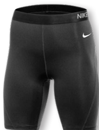
NIKE PRO 8IN SHORT DX9131 Page 47