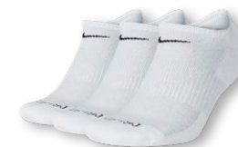
NIKE EVERYDAY PLUS CUSHION NO SHOW 3PPK SX6889 Page 61