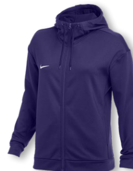
NIKE THERMA ALL TIME FZ RIB DRAWCORD CN9340 Page 16