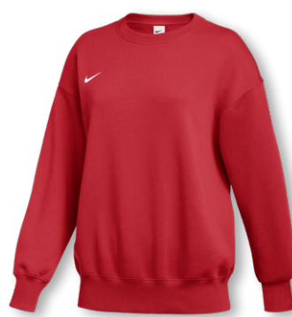
NEW NIKE TEAM SPORTSWEAR PHOENIX CREW HF6896 Page 20