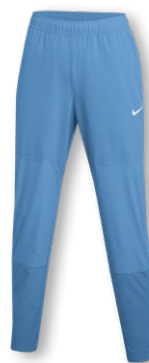
NEW NIKE TEAM PANT DRY WOVEN HF6902 Page 12