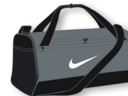
NIKE BRASILIA SMALL DUFFEL 9.5 DM3976 Page 59