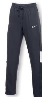
NIKE DRI-FIT PANT CJ1805 Page 13