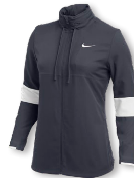
NIKE DRI-FIT JACKET CJ1796 Page 13