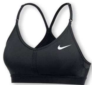
NIKE TEAM INDY V-NECK BRA DJ8523 Page 42