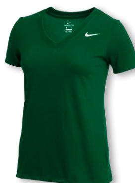
NIKE DRI-FIT SHORT SLEEVE V-NECK CJ1714 Page 29