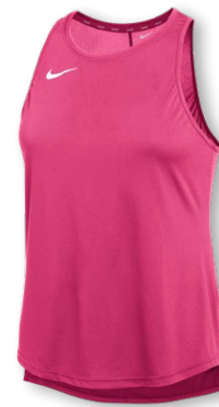
NIKE TEAM ONE DF STD TANK DV6729 Page 30