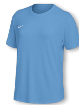
NEW NIKE TEAM ONE RELAXED TOP SS HF6890 Page 28