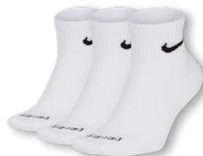
NIKE EVERYDAY PLUS CUSHION ANKLE 3PPK SX6890 Page 61