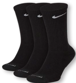
NIKE EVERYDAY PLUS CUSHION CREW 3PPK SX6888 Page 61