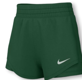
NEW NIKE ONE DF HR 3IN 2IN1 SHORT IM1975 Page 39