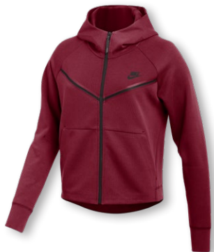
NIKE TEAM TECH FLEECE WINDRUNNER HOODIE FULL ZIP DV6737 Page 9