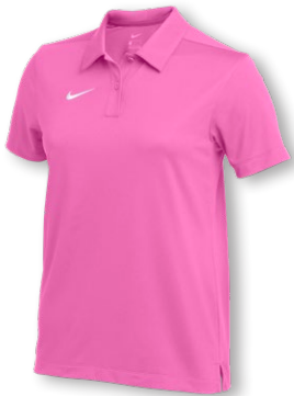
NIKE DF FRANCHISE POLO CU3206 Page 27