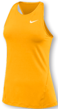
NIKE PRO ALLOVER MESH TANK DH4901 Page 30