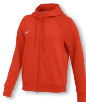
NIKE TEAM PRIMARY HD FZ HF6899 Page 12