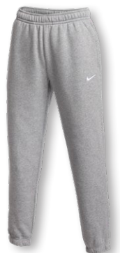
NIKE TEAM CLUB PANT CJ1790 Page 17