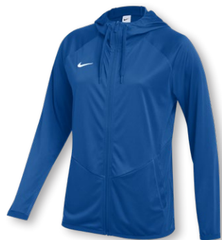
NIKE TEAM FZ HE RELENTLESS JACKET HF6903 Page 13