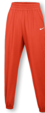
NEW NIKE ONE DF HR 7/8 JOGGER IF2250 Page 22