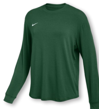
NIKE TEAM ONE RELAXED TOP LS HF6891 Page 18