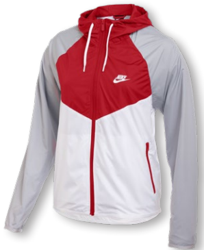
NIKE TEAM WINDRUNNER JACKET CU9550 Page 28