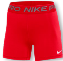
NIKE PRO 365 SHORT 5IN DH4886 Page 34