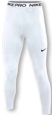
NIKE PRO 365 7/8-LENGTH TIGHT DH4896 Page 32