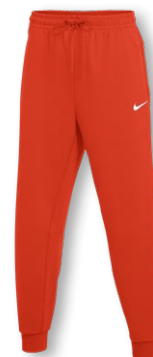
NIKE TEAM PRIMARY PANT HF6900 Page 12