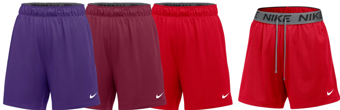
VIEW WITH WAISTBAND DOWN