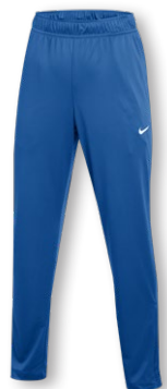
NIKE TEAM FL RELENTLESS PANT HF6904 Page 13