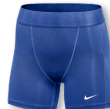
NIKE PRO LEAKPROOF PERIOD PROTECTION TEAM 5IN SHORT FQ3012 Page 35