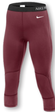
NIKE PRO HYPERCOOL 3QT TIGHT DX9129 Page 33