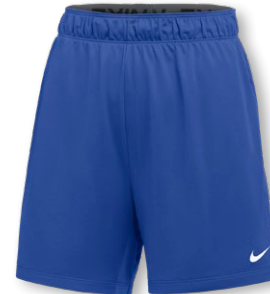
NIKE TEAM DF ATTACK SHORT FJ9860 Page 42