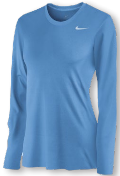
NIKE WMNS LEGEND LS TEE DV7311 Page 23