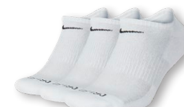
NIKE EVERYDAY PLUS CUSHION NO SHOW 3PPK SX6889 Page 45