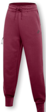
NIKE TEAM TECH FLEECE PANT HR DV6736 Page 9