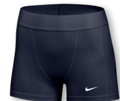
NIKE PRO LEAKPROOF PERIOD PROTECTION 3IN SHORT FQ3007 Page 35