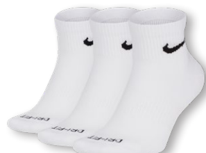
NIKE EVERYDAY PLUS CUSHION ANKLE 3PPK SX6890 Page 45