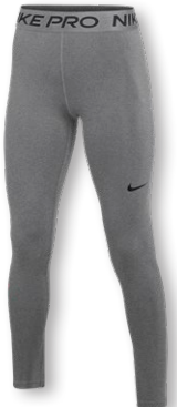
NIKE PRO 365 TIGHT DH4893 Page 32