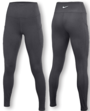
NIKE TEAM ONE DF POCKET TIGHT HF6892 Page 37