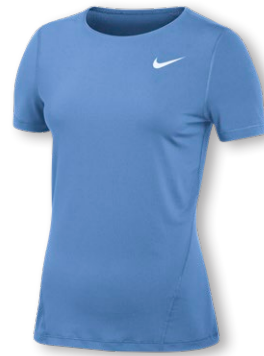
NIKE PRO ALLOVER MESH SS TOP 2.0 DH4905 Page 30