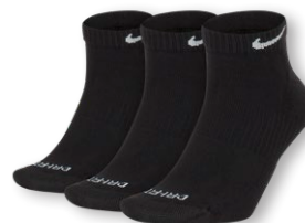
NIKE EVERYDAY PLUS CUSHION LOW 3PPK SX7040 Page 45