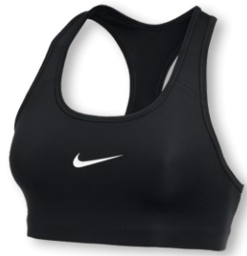
NIKE SWOOSH BRA 2.0 CJ5949 Page 29