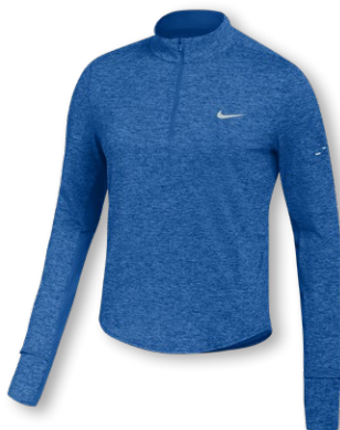
NEW NIKE DRI-FIT SWIFT UV HZ TOP IF2258 Page 20