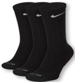
NIKE EVERYDAY PLUS CUSHION CREW 3PPK SX6888 Page 45