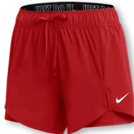
NIKE TEAM DRI-FIT FLEX 2-1 SHORT DJ8680 Page 41