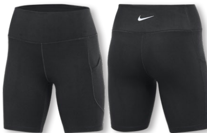
NIKE STOCK DRI-FIT ONE POCKET SHORT HM6891 Page 38