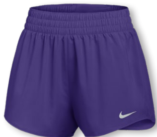
NEW NIKE ONE DF HR 3IN BRIEF SHORT IF2225 Page 39