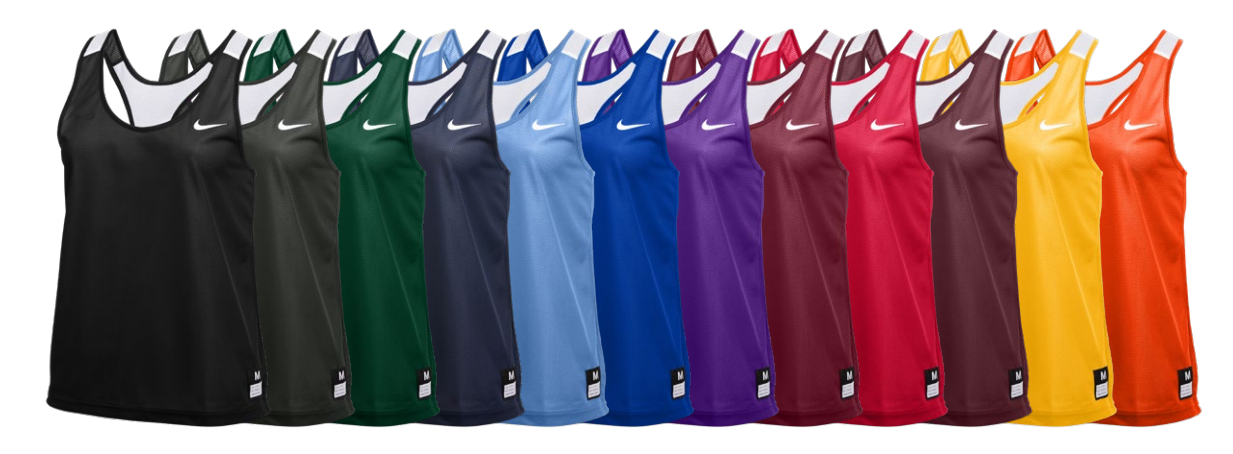
REVERSIBLE DOUBLE LAYER CONSTRUCTION

YOUTH / CW6690 / XS-XL / $20.00 / Body width: 15.75", Body length: 18" (size medium)