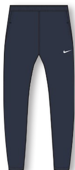
NIKE TEAM MILER REPEL PANT DH8118 Page 18