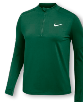
NIKE DRI-FIT ELEMENT 1/2-ZIP TOP DH4951 Page 16