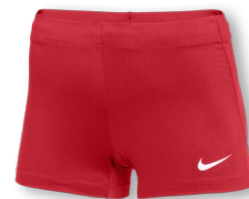
NIKE TEAM STOCK BOY SHORT CV2729 Page 12