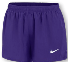
NIKE TEAM 10K RUNNING SHORT DH8121 Page 14