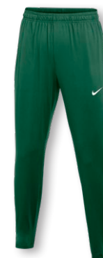
NIKE DRI-FIT ELEMENT PANT DH5183 Page 17