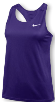
NIKE TEAM RUNNING SINGLET DH8126 Page 14