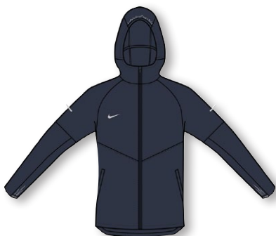
NIKE TEAM MILER REPEL JACKET DH8117 Page 18