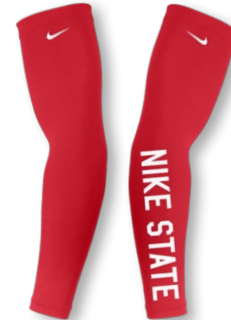
NIKE DIGITAL FAST ARM SLEEVES CW6826 Page 9