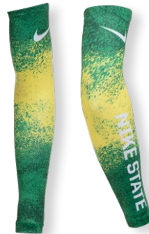
NEW PATTERN NIKE DIGITAL FAST ARM SLEEVES CW6826 Page 9