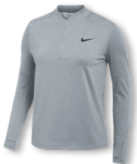
NIKE DRI-FIT ELEMENT 1/2-ZIP TOP DH4951 Page 19