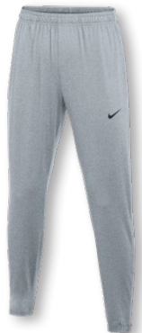
NIKE DRI-FIT ELEMENT PANT DH5183 Page 20