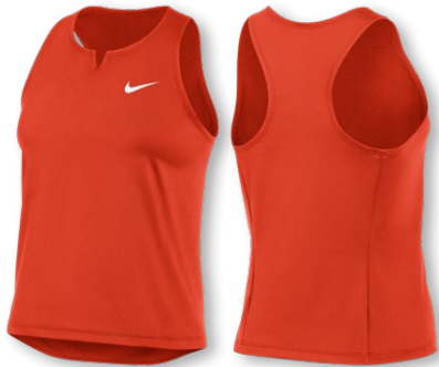
NEW NIKE DF TEAM STOCK AIRBORNE TOP FZ5968 Page 14