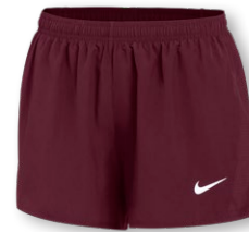
NIKE TEAM 10K RUNNING SHORT DH8121 Page 17