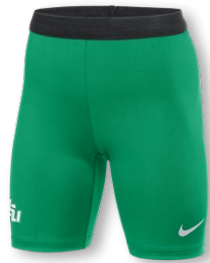
NEW NIKE DF CUSTOM FAST HALF TIGHT FZ5973 Page 12