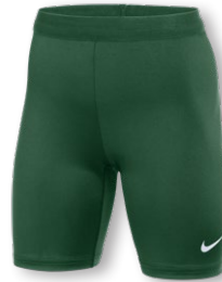
NEW NIKE DF STOCK HALF TIGHT FZ5969 Page 15