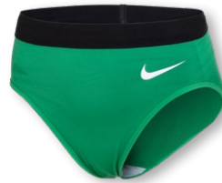
NEW NIKE DF CUSTOM FAST BRIEF FZ5972 Page 13