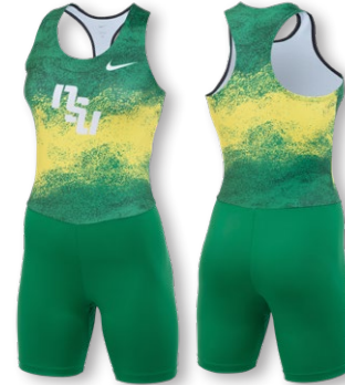
NEW PATTERN NIKE DIGITAL FAST UNITARD CV3665 Page 8