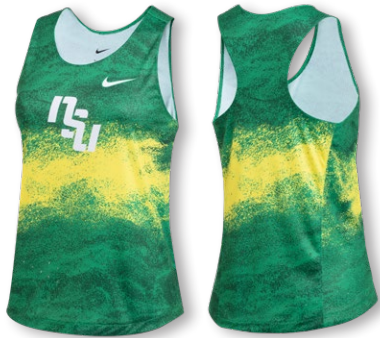
NEW NIKE DF DIGITAL ELITE FAST SINGLET FZ5975 Page 7