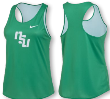
NEW NIKE DF DIGITAL FAST SINGLET FZ5977 Page 11