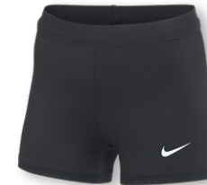
NEW NIKE DF TEAM STOCK TIGHT SHORT FZ5966 Page 15