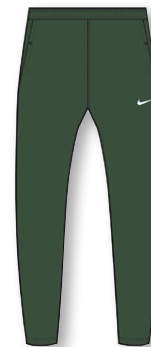
NIKE TEAM MILER REPEL PANT DH8118 Page 21