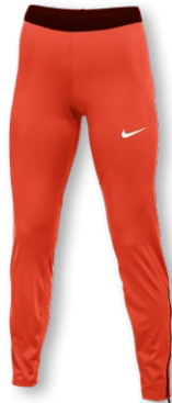
NEW NIKE DF TEAM STOCK FL TIGHT FZ5967 Page 14