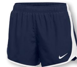
NIKE DRY TEMPO SHORT 849585 Page 18