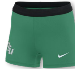
NEW NIKE DF CUSTOM FAST TIGHT SHORT FZ5971 Page 13