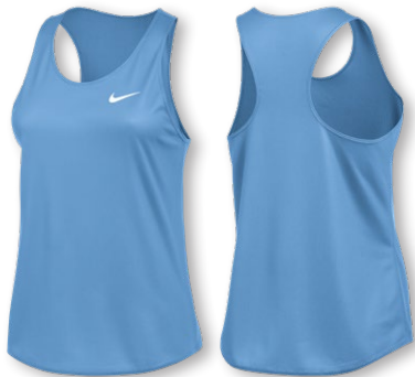
NEW NIKE DF STOCK FAST SINGLET FZ5970 Page 16