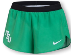
NEW NIKE DF DIGITAL ELITE FAST SHORT FZ5974 Page 7