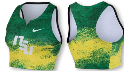
NEW NIKE DF DIGITAL FAST AIRBORNE CROP HF0147 Page 10