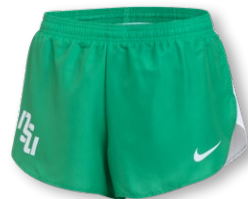
NEW NIKE DF DIGITAL FAST SHORT FZ5976 Page 11