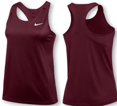
NIKE TEAM RUNNING SINGLET DH8126 Page 17