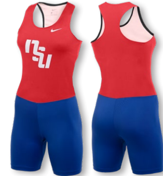
NIKE DIGITAL FAST UNITARD CV3665 Page 8