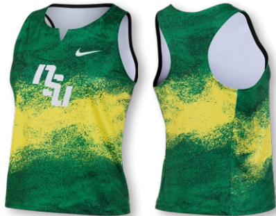
NEW NIKE DF DIGITAL FAST AIRBORNE TOP FZ5978 Page 9