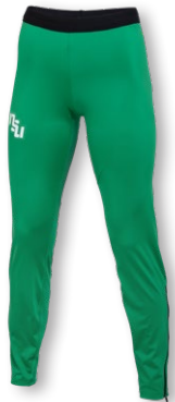
NEW NIKE DF CUSTOM FAST FL TIGHT FZ5979 Page 12