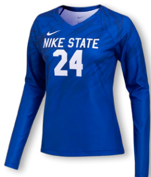
NEW PATTERN NIKE DIGITAL HYPERELITE LS JERSEY BV1012 Page 6