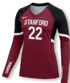
NIKE DIGITAL ELITE LS JERSEY DJ8535 Page 9