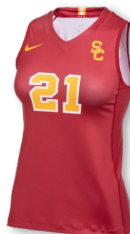
NIKE DIGITAL CLUB ACE SL JERSEY CZ1367 Page 13