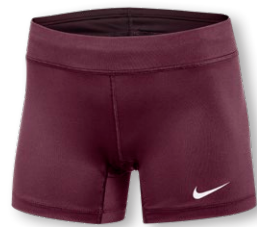
NIKE 5" PERFORMANCE GAME SHORT DV6740 Page 22