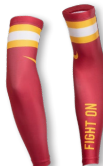
NIKE DIGITAL CLUB ACE ARM SLEEVE CZ1433 Page 14