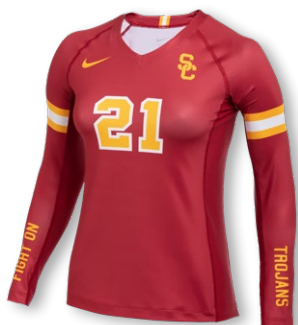
NIKE DIGITAL CLUB ACE LS JERSEY CZ1384 Page 11