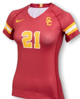
NIKE DIGITAL CLUB ACE SS JERSEY CZ1401 Page 12