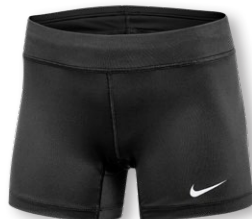
NIKE CUSTOM PERFORMANCE GAME SHORT FD0203 Page 16