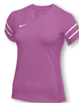
NIKE STOCK CLUB ACE SS JERSEY CZ1432 Page 20