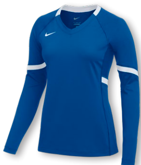
NIKE STOCK ELITE LS JERSEY DJ8626 Page 17