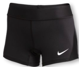
NIKE CUSTOM HYPERELITE SHORT BV1019 Page 16