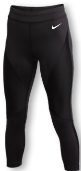
NIKE CUSTOM HYPERELITE CAPRI BV1018 Page 15