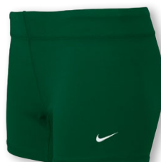
NIKE PERFORMANCE GAME SHORT 108720 Page 23