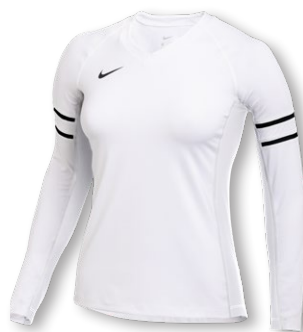
NIKE STOCK CLUB ACE LS JERSEY CZ1429 Page 19