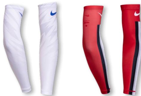
NEW PATTERNS NIKE DIGITAL HYPERELITE ARM SLEEVE BV1015 Page 8