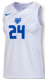
NEW PATTERN NIKE DIGITAL HYPERELITE SL JERSEY BV1011 Page 7