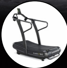
Cascade Ultra Runner