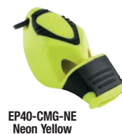
EP40-CMG-NE Neon Yellow