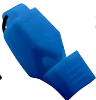
Z40L-CMG-BL Blue Fuziun