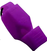
Z40L-CMG-PU Purple Fuziun