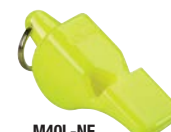
M40L-NE Neon Yellow