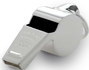
60 1/2SP Silver Plated 60 1/2

Three special editions of the Acme Thunderer 60 1/2 whistle are now available. The ever popular Gold plated, and the Silver plated and Rose Gold plated models. Each whistle comes in its own blue presentation box and makes an excellent gift for a special coach, athlete, or teacher!