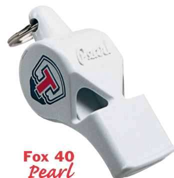
Fox 40 Pearl with logo