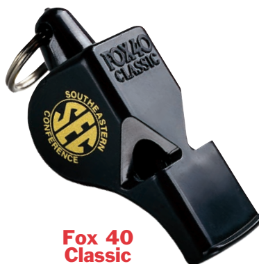
Fox 40 Classic with logo

Almost Any Fox40 Plastic Whistle is available personalized with the name or logo of a store, school, conference, corporation, community, etc. Minimum order of 12 Dozen Whistles per Logo.