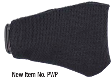
New Item No. PWP Protective Whistle Pouch