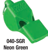
040-SGR Neon Green