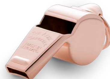
60 1/2RGP Rose Gold Plated 60 1/2