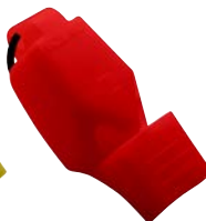
Z40L-CMG-RE Red Fuziun