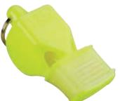
(NE) Neon Yellow