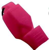
Z40L-CMG-PI Pink Fuziun