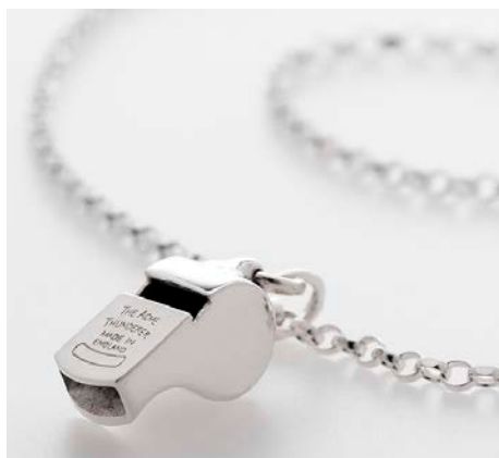
TNSS Thunderer Necklace Solid Silver

The best gifts come in small packages. May we suggest a touch of luxury... Three stunning, fully working miniature replica necklaces of the ever popular Acme Thunderer whistle in Solid Sterling Silver, Solid Sterling Silver with Gold plating, and Solid Sterling Silver with Rose Gold plating. Each necklace comes in an Acme jewelry box, and is Hallmarked at the Birmingham Assay Office in England. A perfect gift for the athlete, coach, teacher or any woman with discriminating taste!