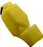
Z40L-CMG-YE Yellow Fuziun