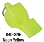
040-SNE Neon Yellow