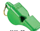
M40L-GR Neon Green