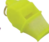
S40L-CMG-NE Neon Yellow