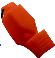
Z40L-CMG-OR Orange Fuziun