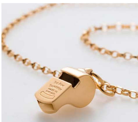
TNSSGP Thunderer Necklace Solid Silver with Gold Plating