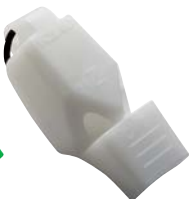
Z40L-CMG-WH White Fuziun