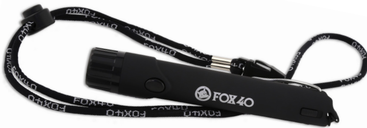
Item No. EMINI

NEW! The Three Tone Fox 40 Electronic Whistle is now available in referee black. The Three Tones are the same as the 8040 in red.