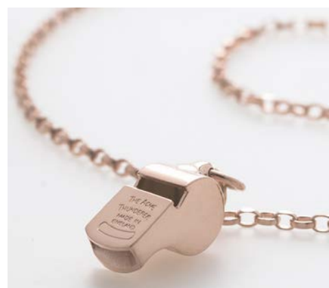
TNSSRGP Thunderer Necklace Solid Silver with Rose Gold Plating

Three special editions of the Acme Thunderer 60 1/2 whistle are now available. The ever popular Gold plated, and the Silver plated and Rose Gold plated models. Each whistle comes in its own blue presentation box and makes an excellent gift for a special coach, athlete, or teacher!