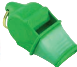
S40L-CMG-GR Neon Green