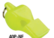
40P-NE Neon Yellow