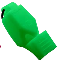
Z40L-CMG-GR Neon Green Fuziun