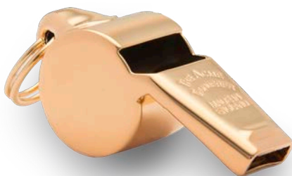
60 1/2GP Gold Plated 60 1/2