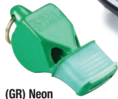
(GR) Neon Green