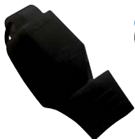
Z40L-CMG Black Fuziun

Fox 40 Fuziun CMG with Matching Color Breakaway Logo Lanyard