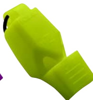
Z40L-CMG-NE Neon Yellow Fuziun