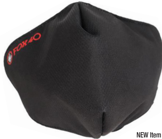
NEW Item No. MASK40 Tri-Layer Whistle Face Mask