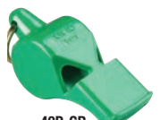
40P-GR Neon Green