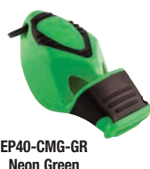
EP40-CMG-GR Neon Green