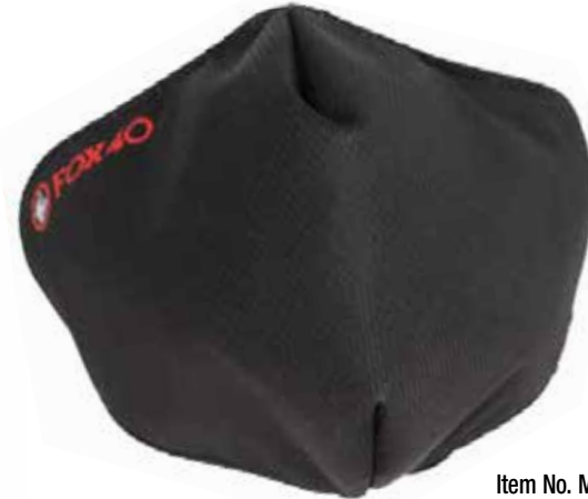
Item No. MASK40 Tri-Layer Whistle Face Mask