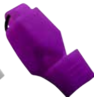
Z40L-CMG-PU Purple Fuziun