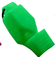
Z40L-CMG-GR Neon Green Fuziun