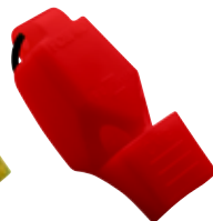
Z40L-CMG-RE Red Fuziun