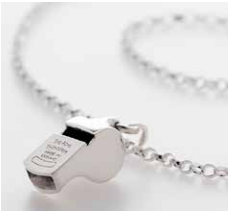
TNSS Thunderer Necklace Solid Silver

The best gifts come in small packages. May we suggest a touch of luxury... Three stunning, fully working miniature replica necklaces of the ever popular Acme Thunderer whistle in Solid Sterling Silver, Solid Sterling Silver with Gold plating, and Solid Sterling Silver with Rose Gold plating. Each necklace comes in an Acme jewelry box, and is Hallmarked at the Birmingham Assay Office in England. A perfect gift for the athlete, coach, teacher or any woman with discriminating taste!