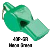
40P-GR Neon Green