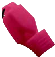
Z40L-CMG-PI Pink Fuziun