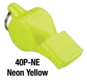
40P-NE Neon Yellow