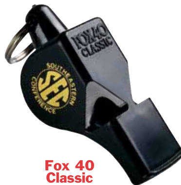
Fox 40 Classic with logo

Almost Any Fox40 Plastic Whistle is available personalized with the name or logo of a store, school, conference, corporation, community, etc. Minimum order of 12 Dozen Whistles per Logo.