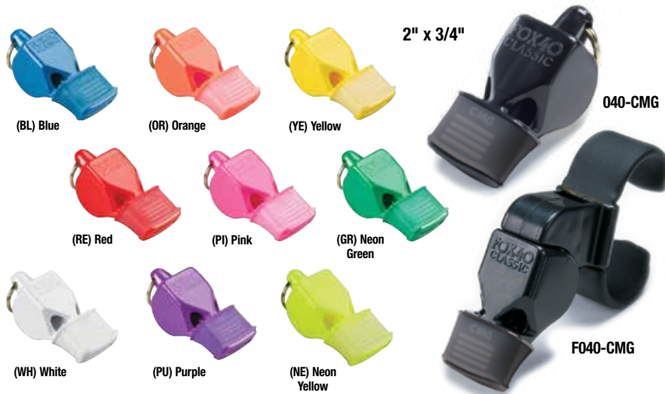
2" x 3/4"