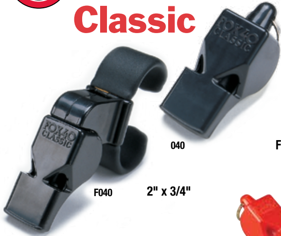
F040 2" x 3/4"

040 The Classic Fox 40 (Referee Blister Card) Used worldwide in collegiate, professional and Olympic competitions. The original 3 chamber pealess whistle w/shrill piercing sound.