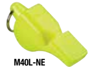
M40L-NE Neon Yellow