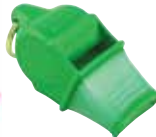
S40L-CMG-GR Neon Green