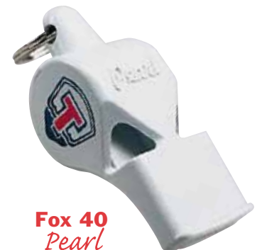
Fox 40 Pearl with logo