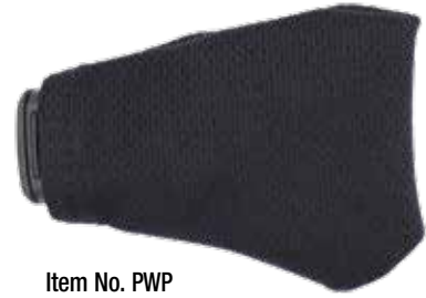
Item No. PWP Protective Whistle Pouch