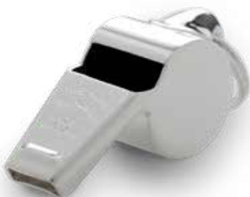
60 1/2SP Silver Plated 60 1/2

Three special editions of the Acme Thunderer 60 1/2 whistle are now available. The ever popular Gold plated, and the Silver plated and Rose Gold plated models. Each whistle comes in its own blue presentation box and makes an excellent gift for a special coach, athlete, or teacher!