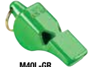
M40L-GR Neon Green