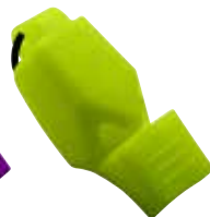
Z40L-CMG-NE Neon Yellow Fuziun

Fox 40 Fuziun CMG with Matching Color Breakaway Logo Lanyard