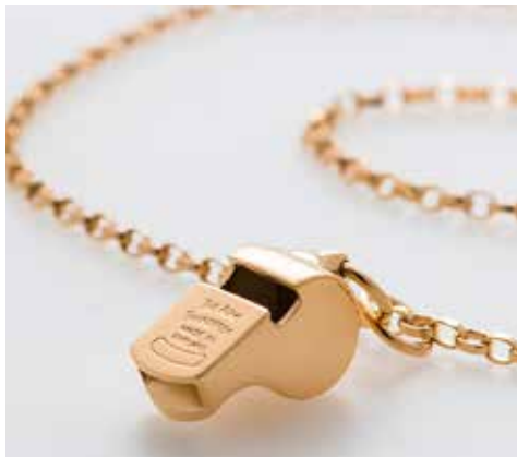
TNSSGP Thunderer Necklace Solid Silver with Gold Plating