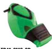
EP40-CMG-GR Neon Green