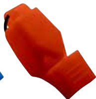
Z40L-CMG-OR Orange Fuziun