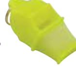
S40L-CMG-NE Neon Yellow