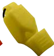
Z40L-CMG-YE Yellow Fuziun