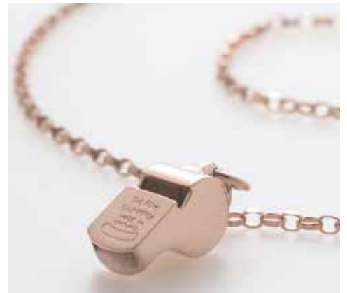
TNSSRGP Thunderer Necklace Solid Silver with Rose Gold Plating

Three special editions of the Acme Thunderer 60 1/2 whistle are now available. The ever popular Gold plated, and the Silver plated and Rose Gold plated models. Each whistle comes in its own blue presentation box and makes an excellent gift for a special coach, athlete, or teacher!