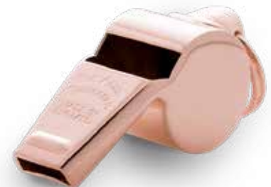
60 1/2RGP Rose Gold Plated 60 1/2