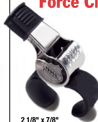
2 1/8" x 7/8"