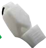
Z40L-CMG-WH White Fuziun