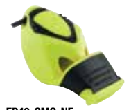
EP40-CMG-NE Neon Yellow