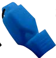
Z40L-CMG-BL Blue Fuziun