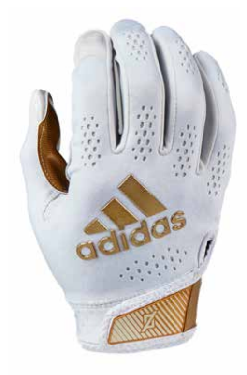
WHITE/MET. GOLD 228