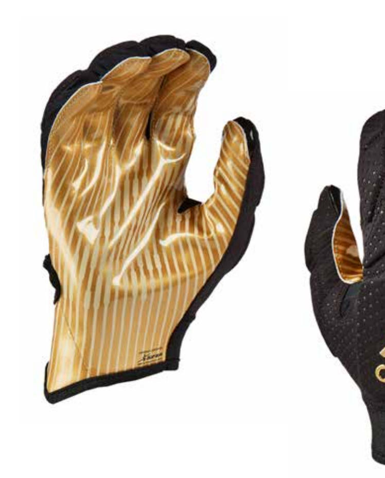
BLACK/METALLIC GOLD 194