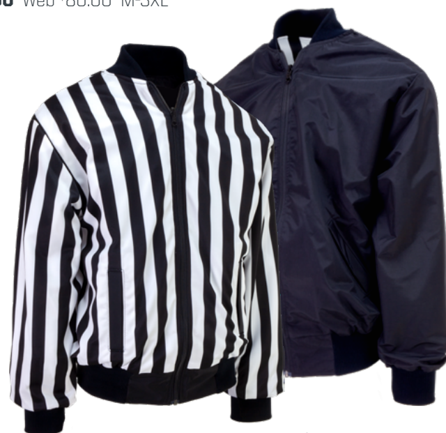
LIKE TWO JACKETS IN ONE!