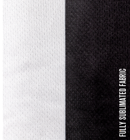
FULLY SUBLIMATED FABRIC