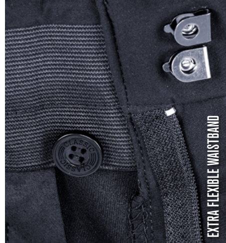
EXTRA FLEXIBLE WAISTBAND