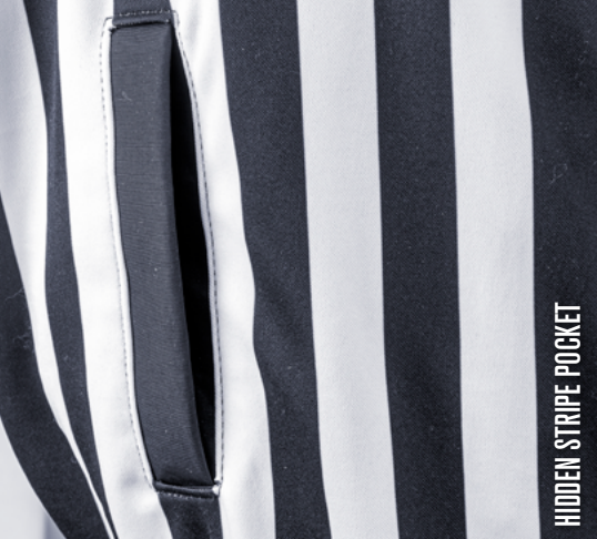
HIDDEN STRIPE POCKET