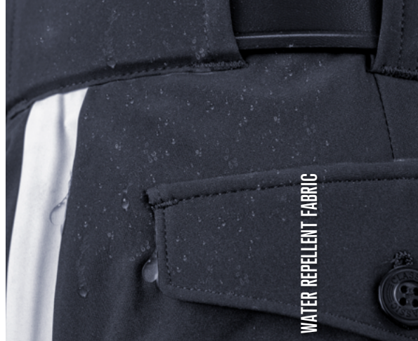
WATER REPELLENT FABRIC