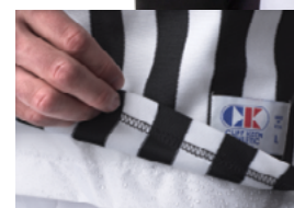
MOISTURE BEADS UP AND ROLLS OFF!