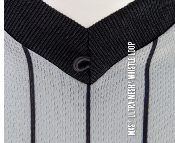
MXS® ULTRA-MESH® WHISTLE LOOP