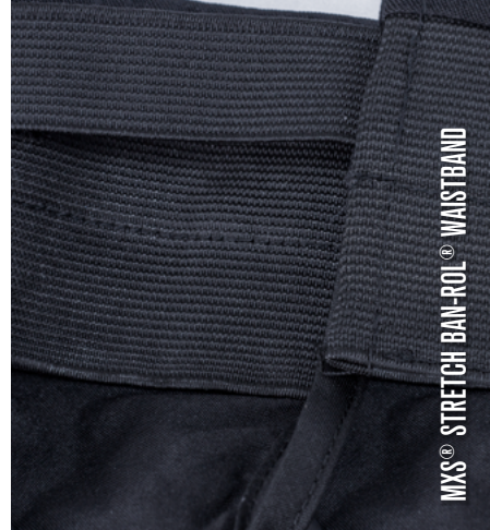
MXS® STRETCH BAN-ROL® WAISTBAND