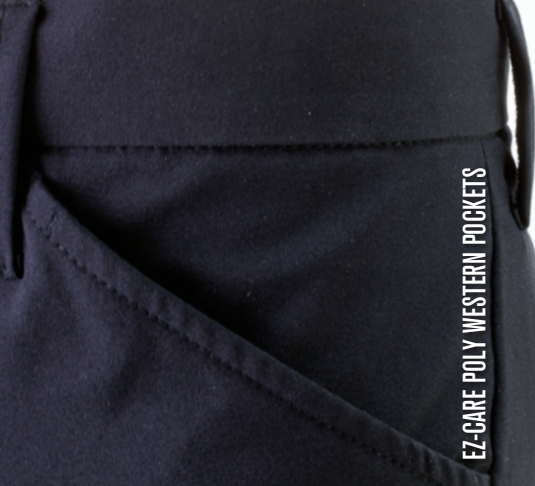
EZ-CARE POLY WESTERN POCKETS