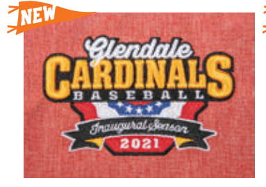
DROP #SEO41 Raised & Flat Embroidery