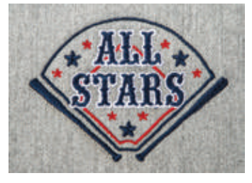
DROP #SE023 Flat Embroidery