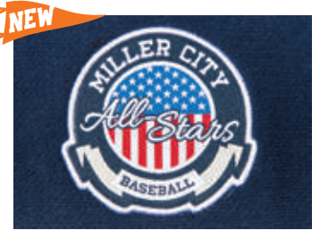
DROP #SE047 Woven Label w/ Satin Stitch