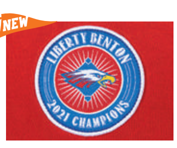
DROP #SE046 Woven Label w/ Merrowed Edge