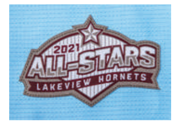
DROP #SE014 Woven Label w/ Jump Stitch