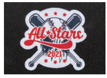
DROP #SE030 Woven Label w/ Jump Stitch