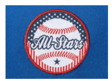
DROP #SE028 Woven Label w/ Merrowed Edge