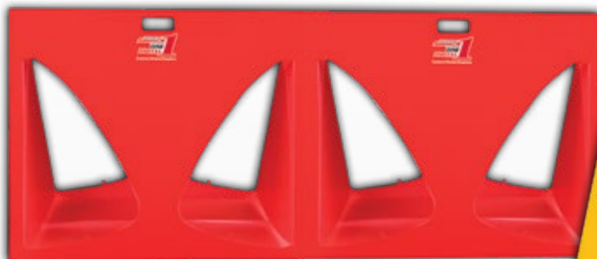
Ultimate A-Frame is a trademark of Source One Digital

SIZES: 96" wide x 34" high and collapses for easy storage and transportation