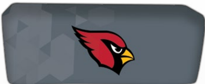
FITTED TABLE THROW

FABRIC: Full color, dye-sublimated wrinkle resistant fabric