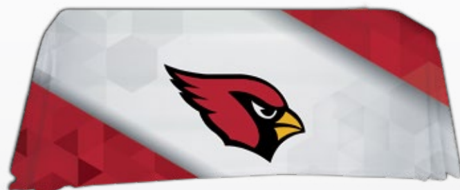
FULL TABLE THROW