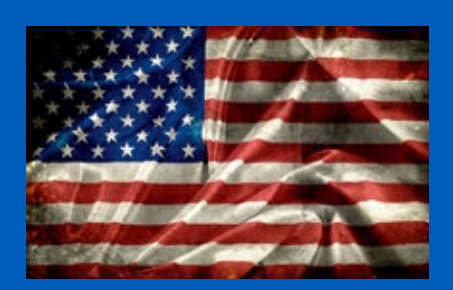
Proudly Made in the USA