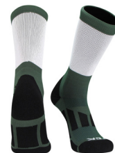
727 dark green