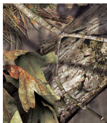
BREAK-UP COUNTRY® DSC023