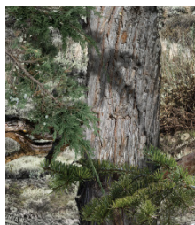
MOUNTAIN COUNTRY® DSC024